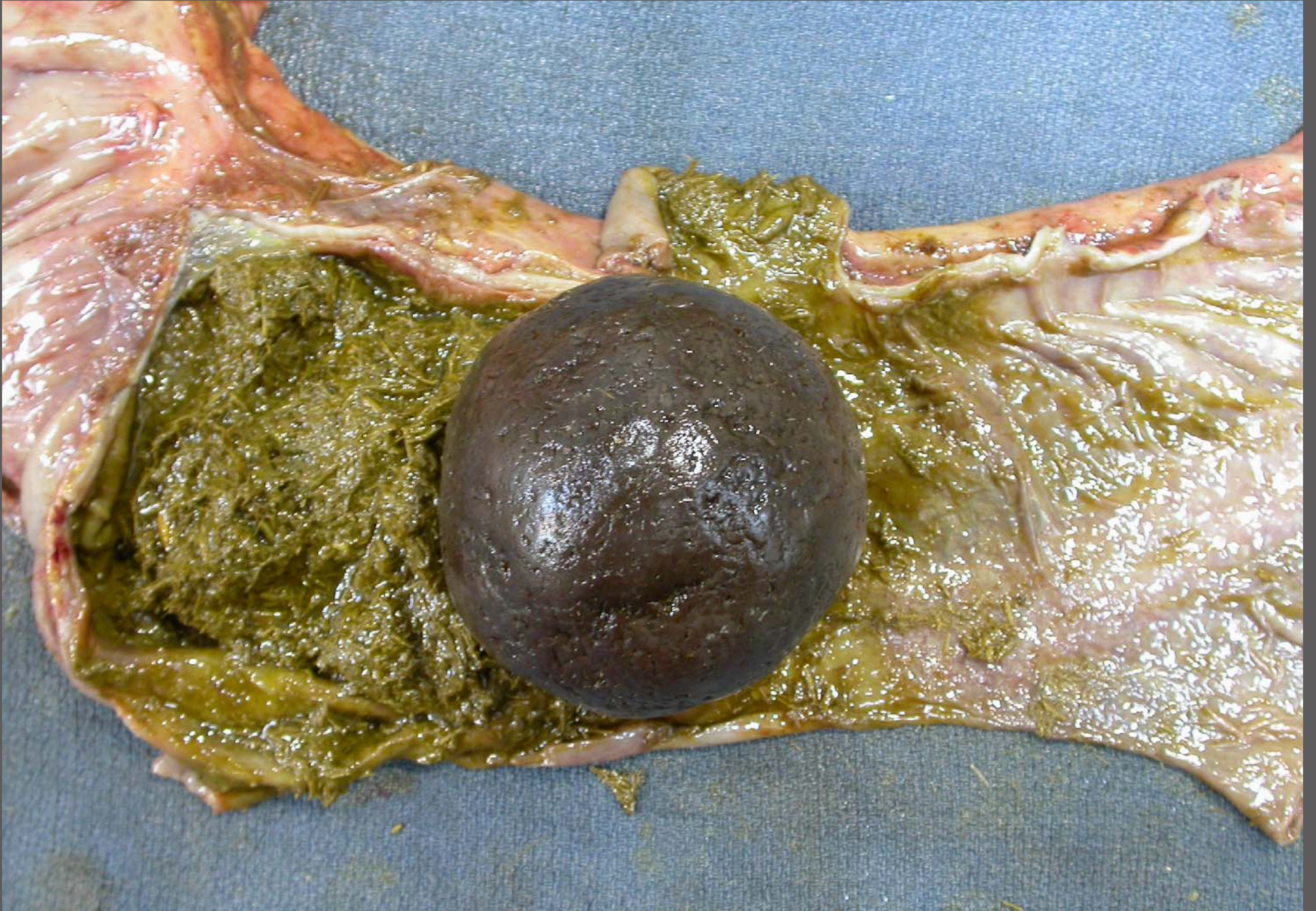
Pelvic flexure – lithobezoar with focal compression, necrosis and rupture