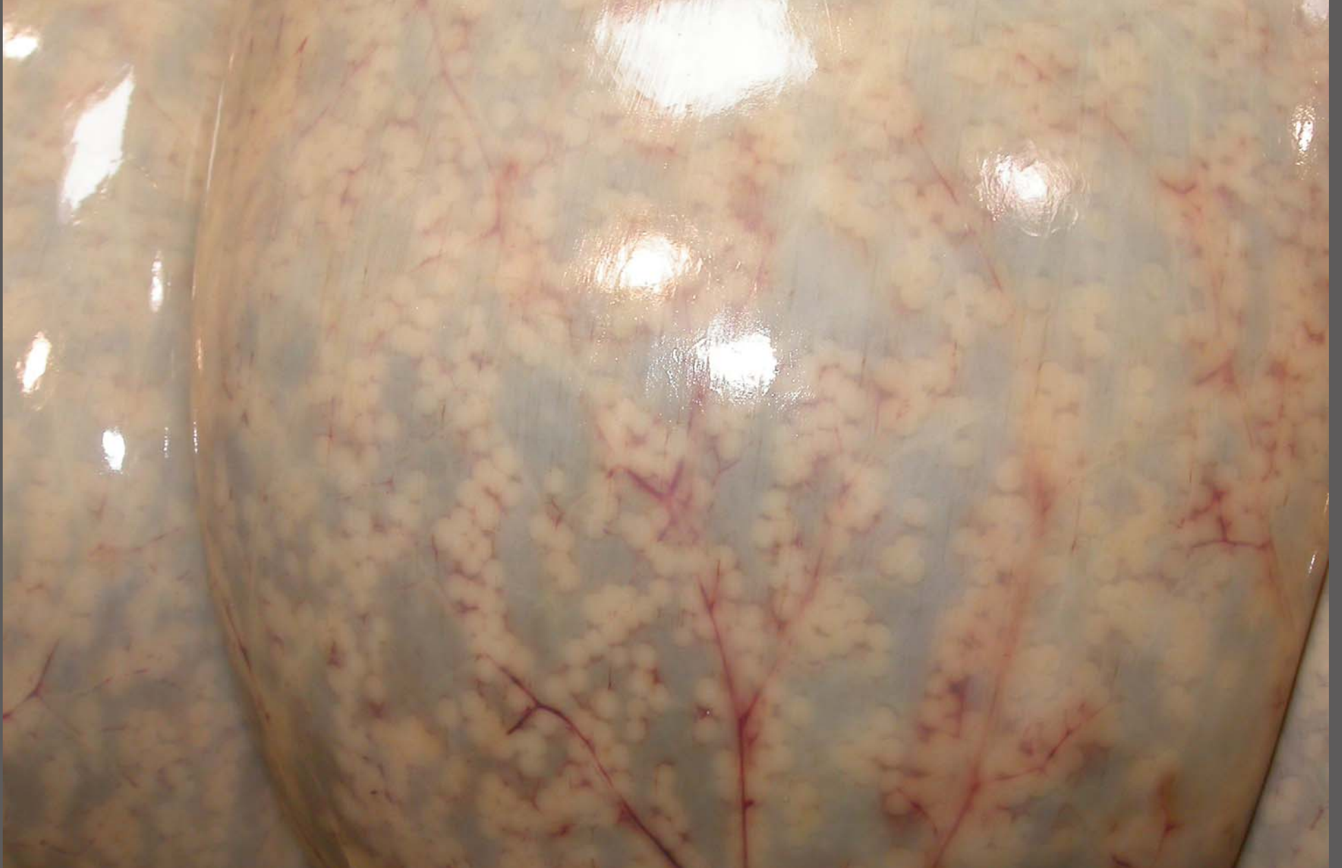
Foal – Large intestine – GALT hyperplasia – DD: unknown; chronic infection; Salmonella.