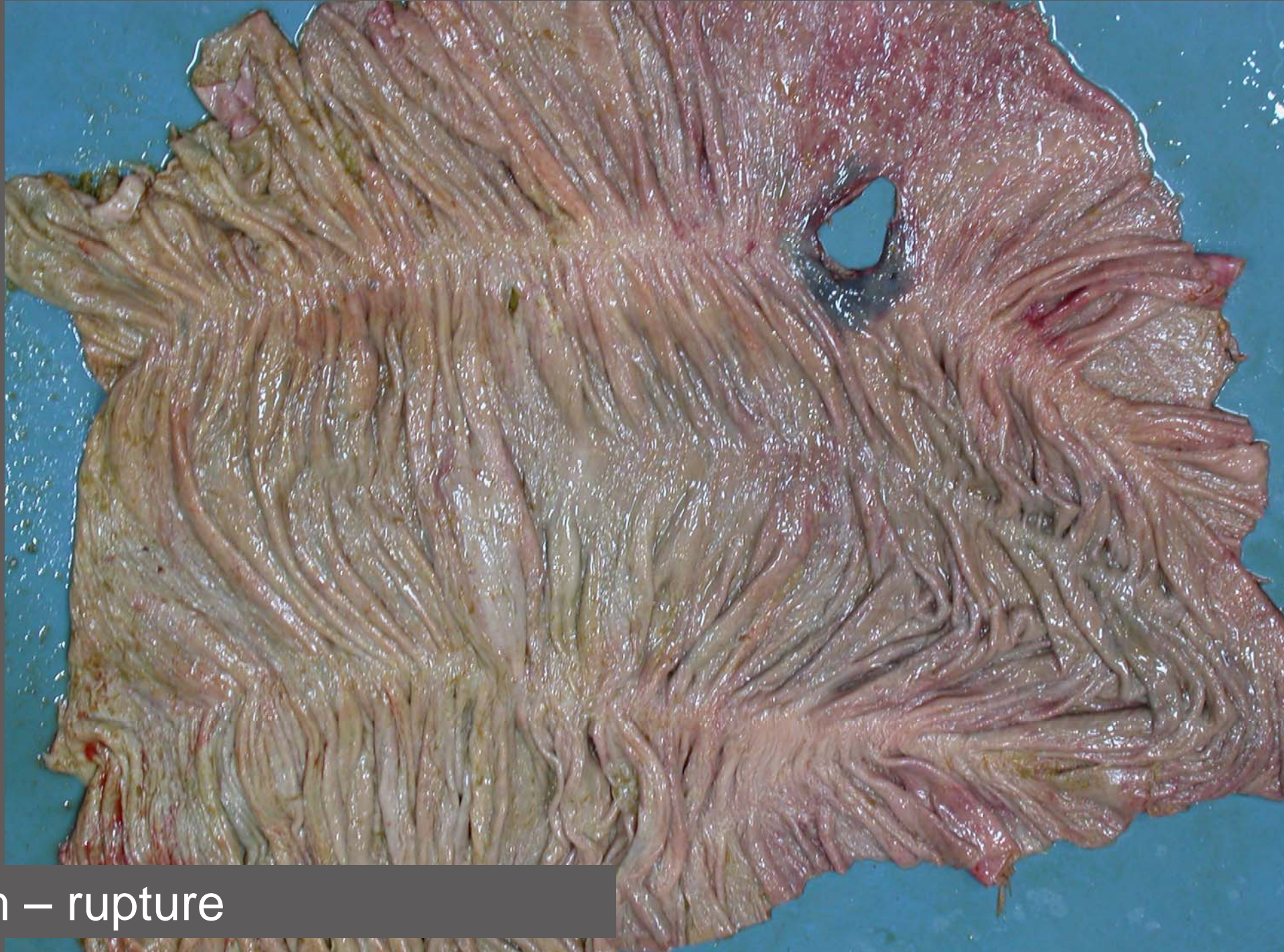
Cecum – rupture