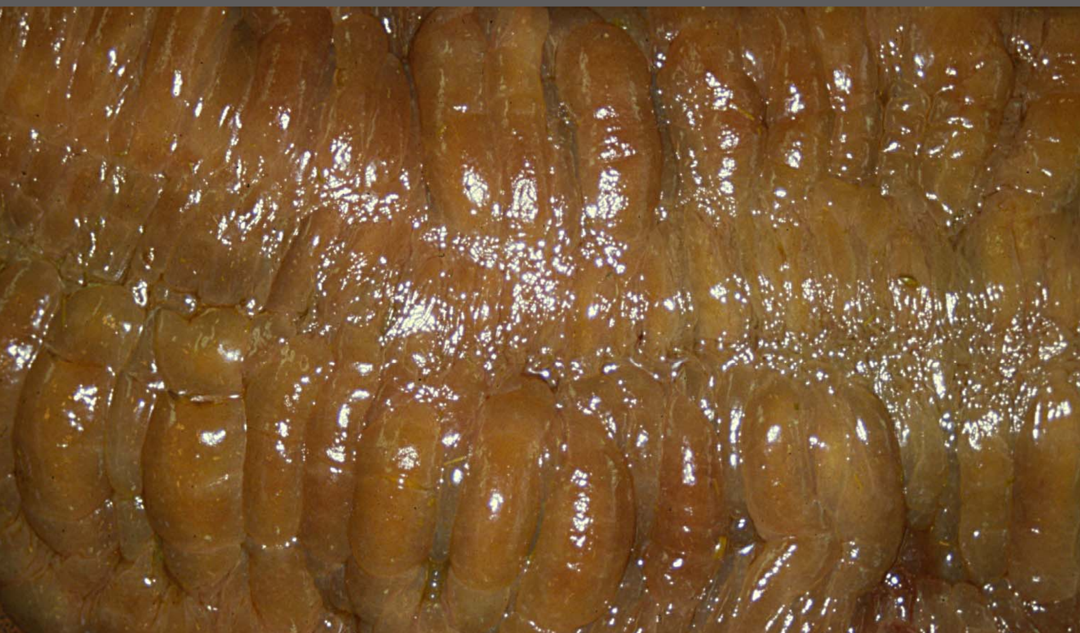
Colon – severe edema – DD: displacement; Potomac horse fever; Salmonella; hypoproteinemia