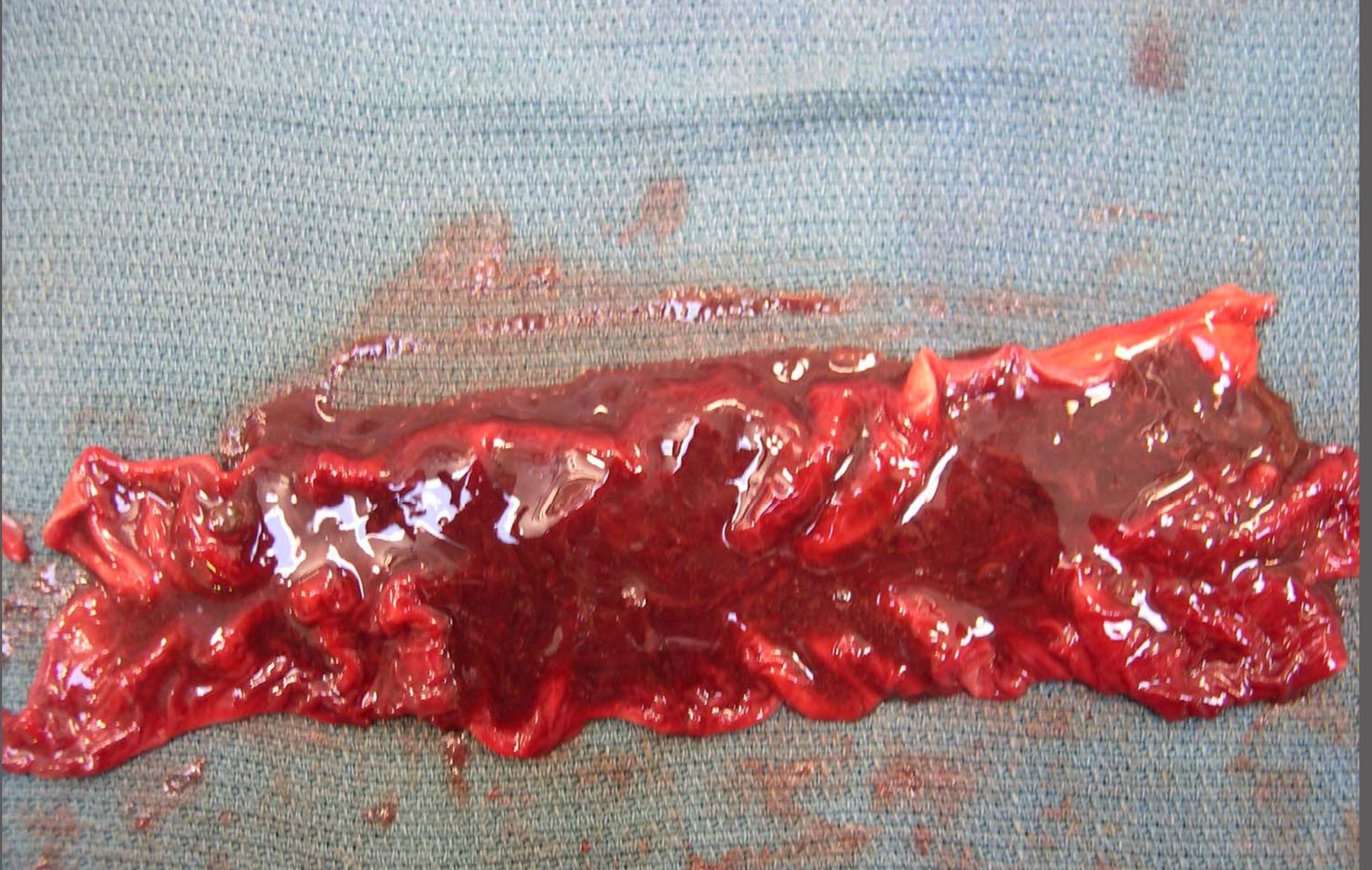
Foal – small intestine thrombosis and hemorrhage – DIC associated with sepsis