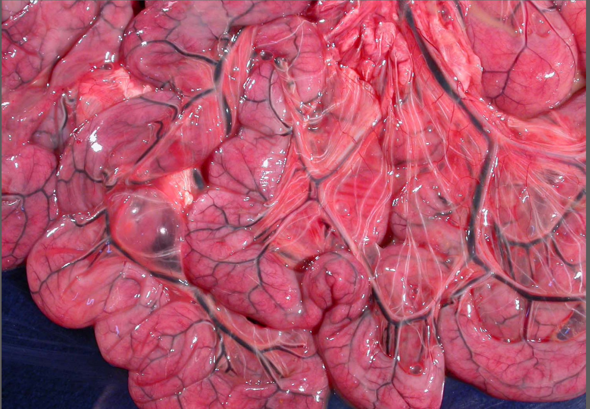
Foal – catarrhal and fibrinous enteritis – Salmonella spp.