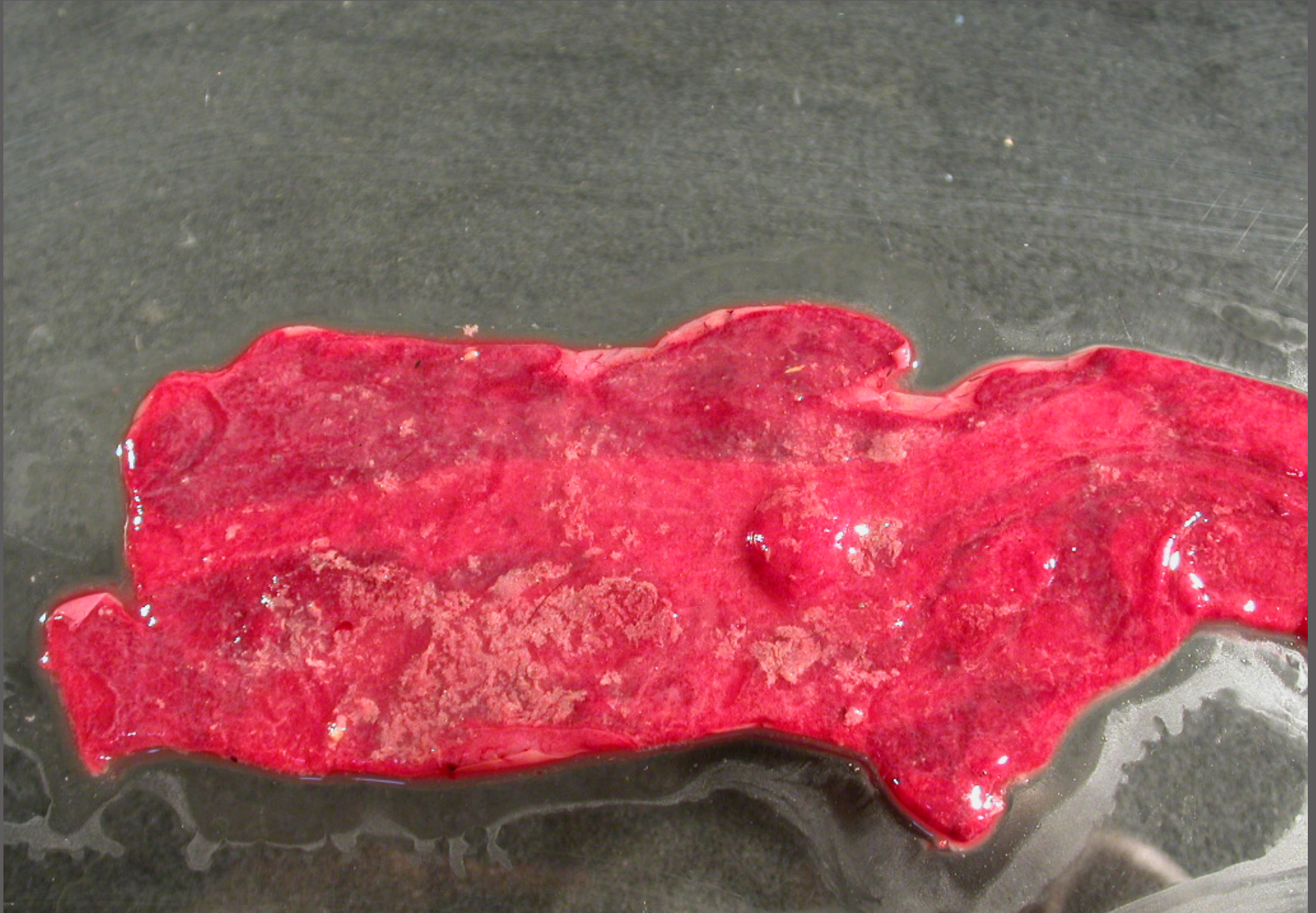
Foal – catarrhal and fibrinous enteritis – Salmonella spp.