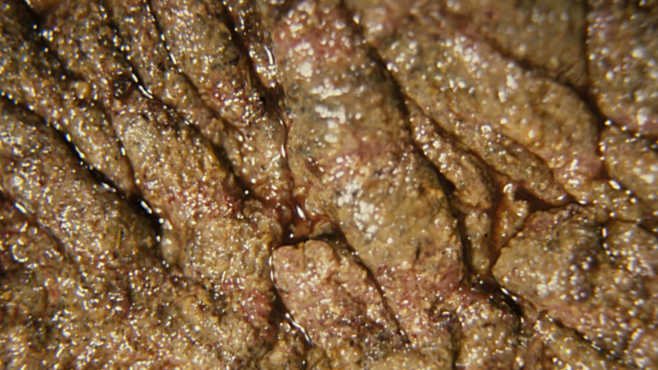
Large intestine – chronic necrotizing typhlocolitis – Salmonella spp.