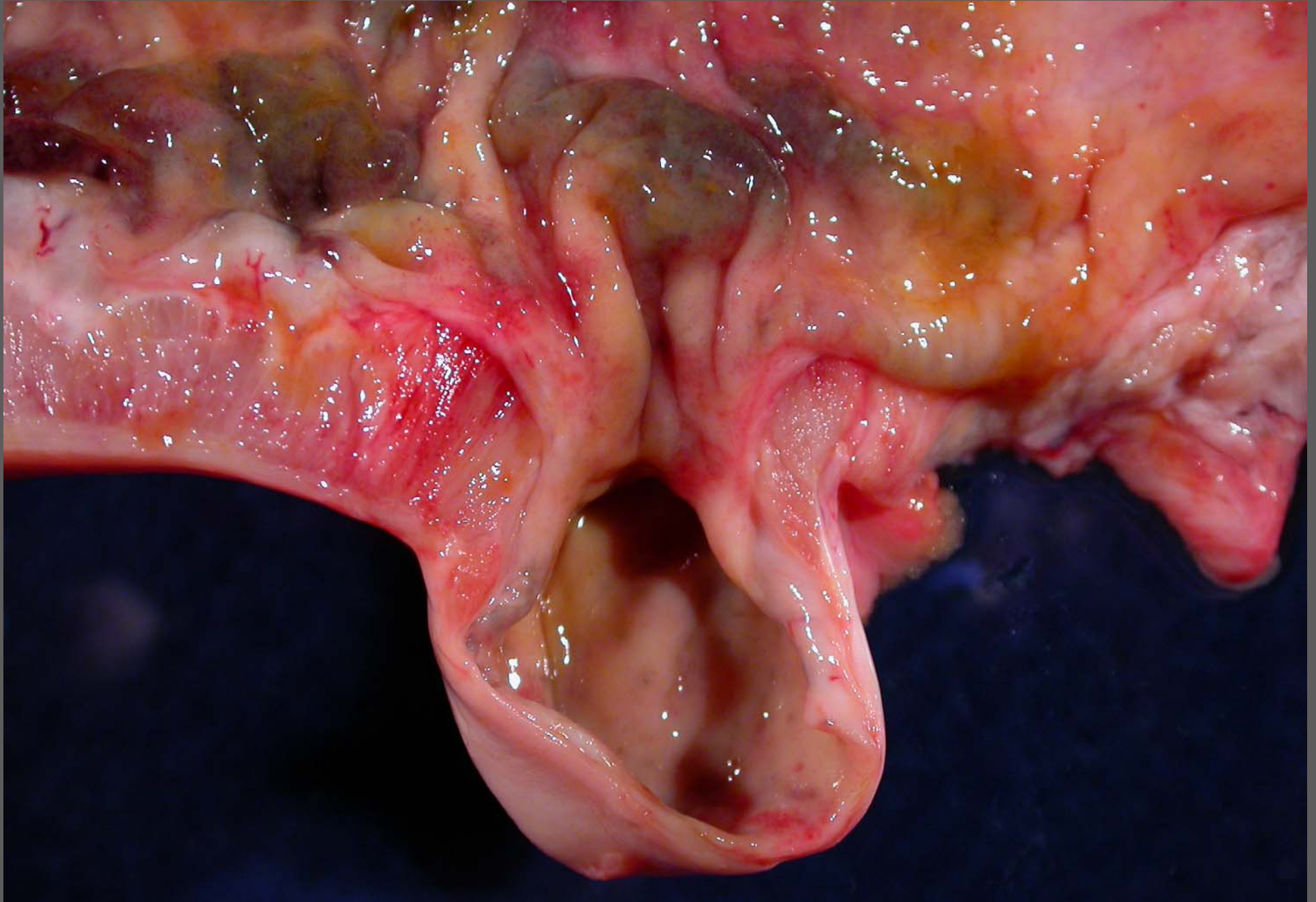
Ileum – hypertrophy/hyperplasia with diverticulum formation