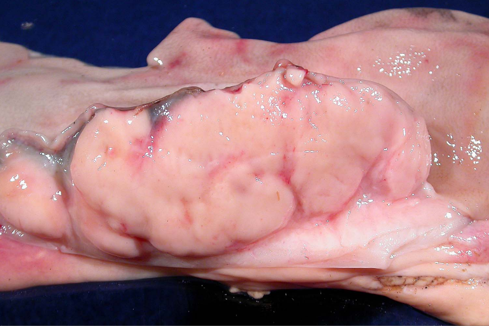
Abomasum – lymphoma