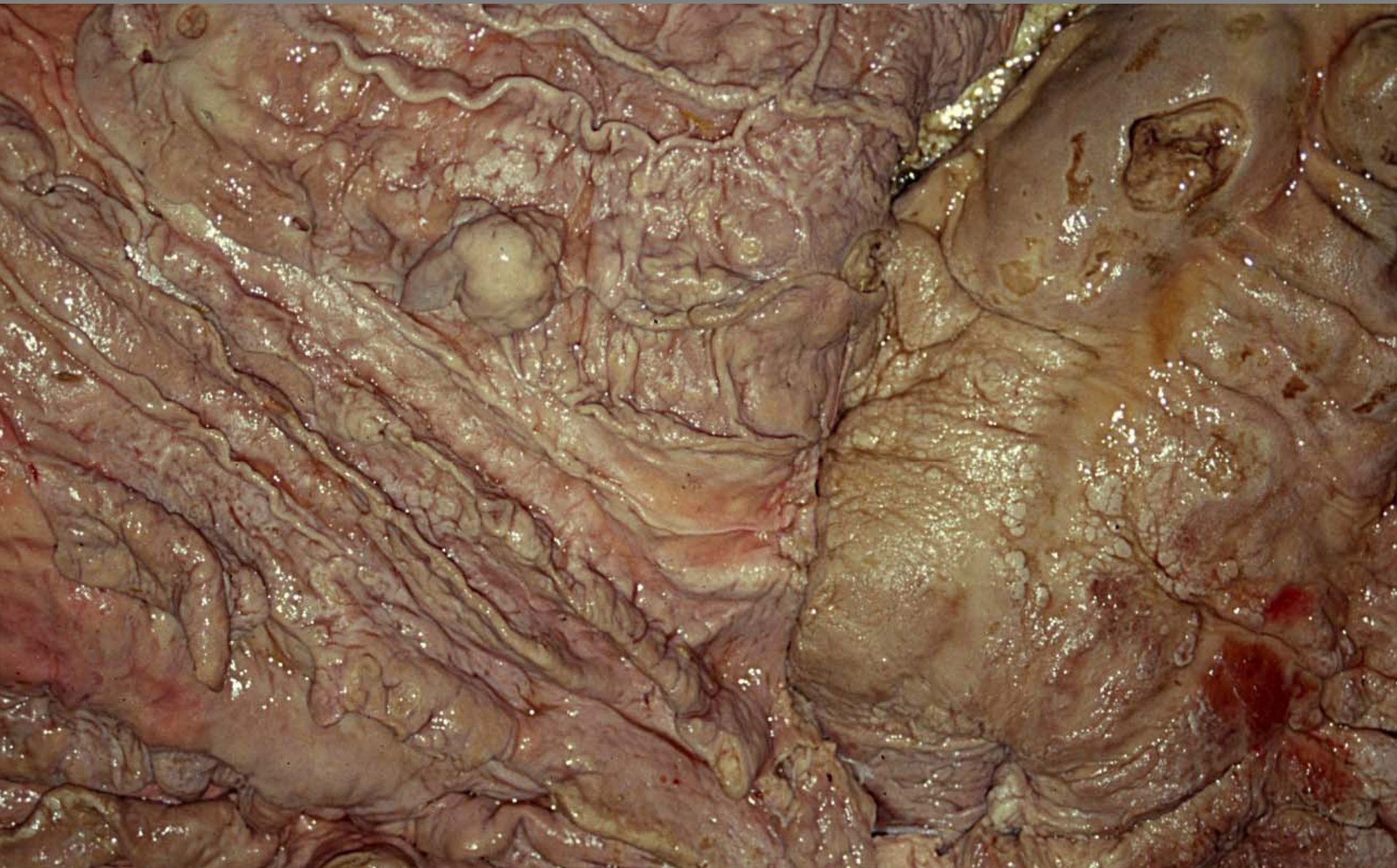
Abomasum – lymphoma with necrosis and ulcers