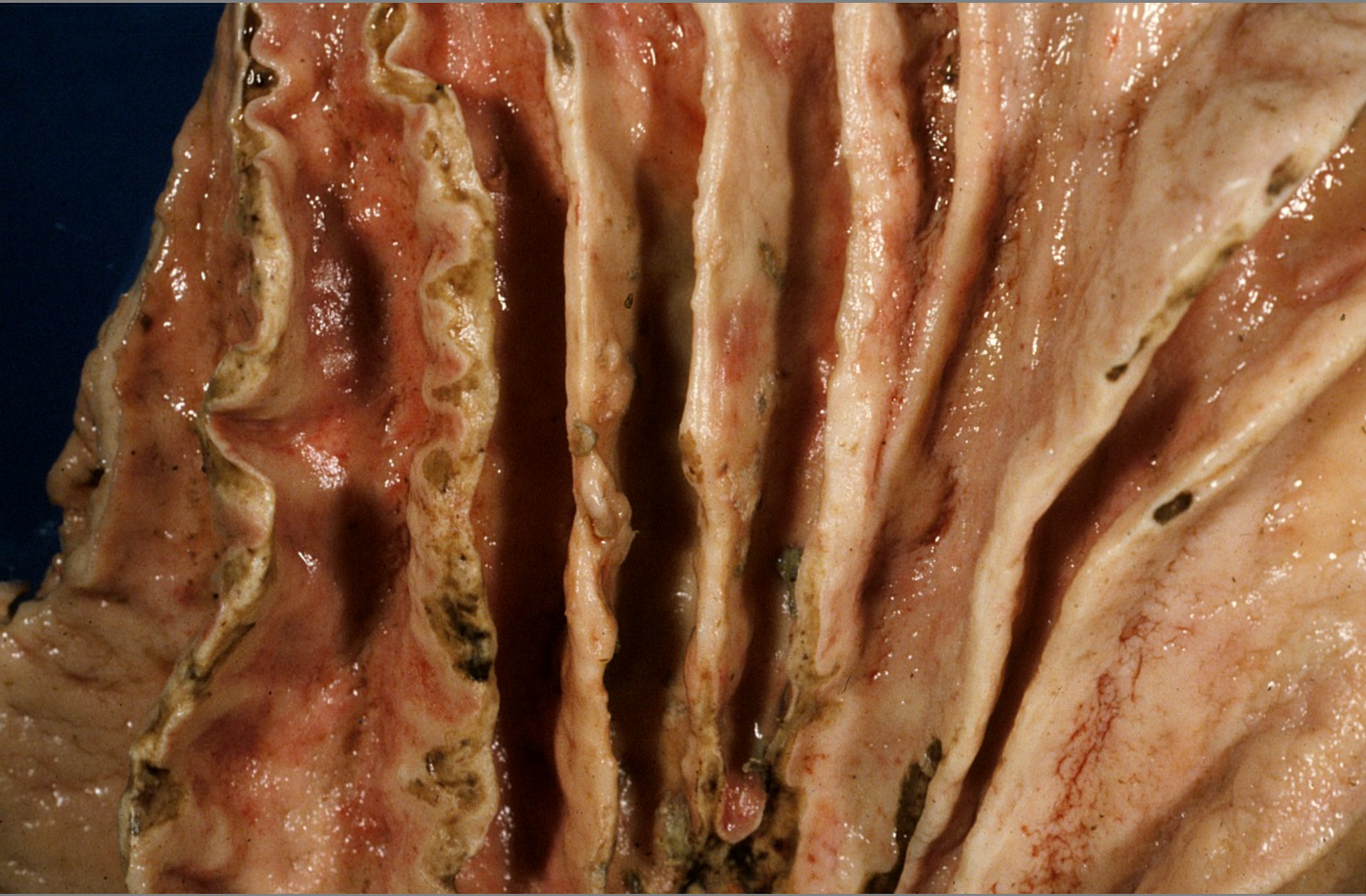
Abomasum – lymphoma