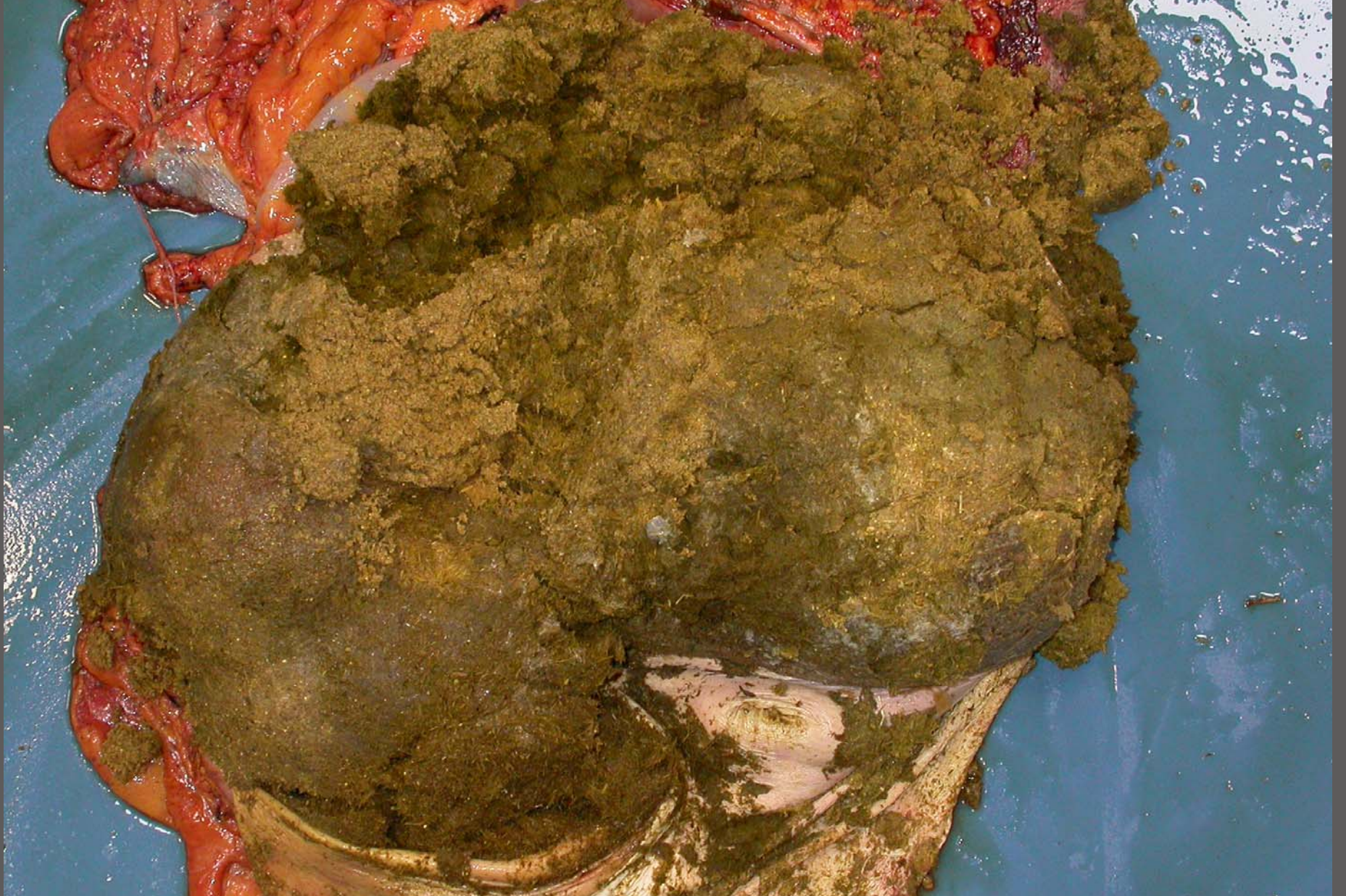
Stomach – idiopathic impaction with smooth muscle hypertrophy and hyperplasia