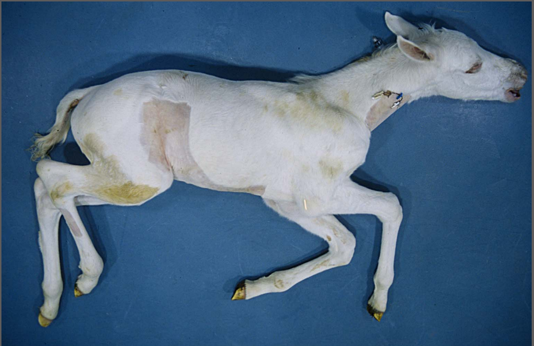
Overo foal – colonic aganglionosis (Hirschsprung disease) – prominent diffuse hypopigmentation