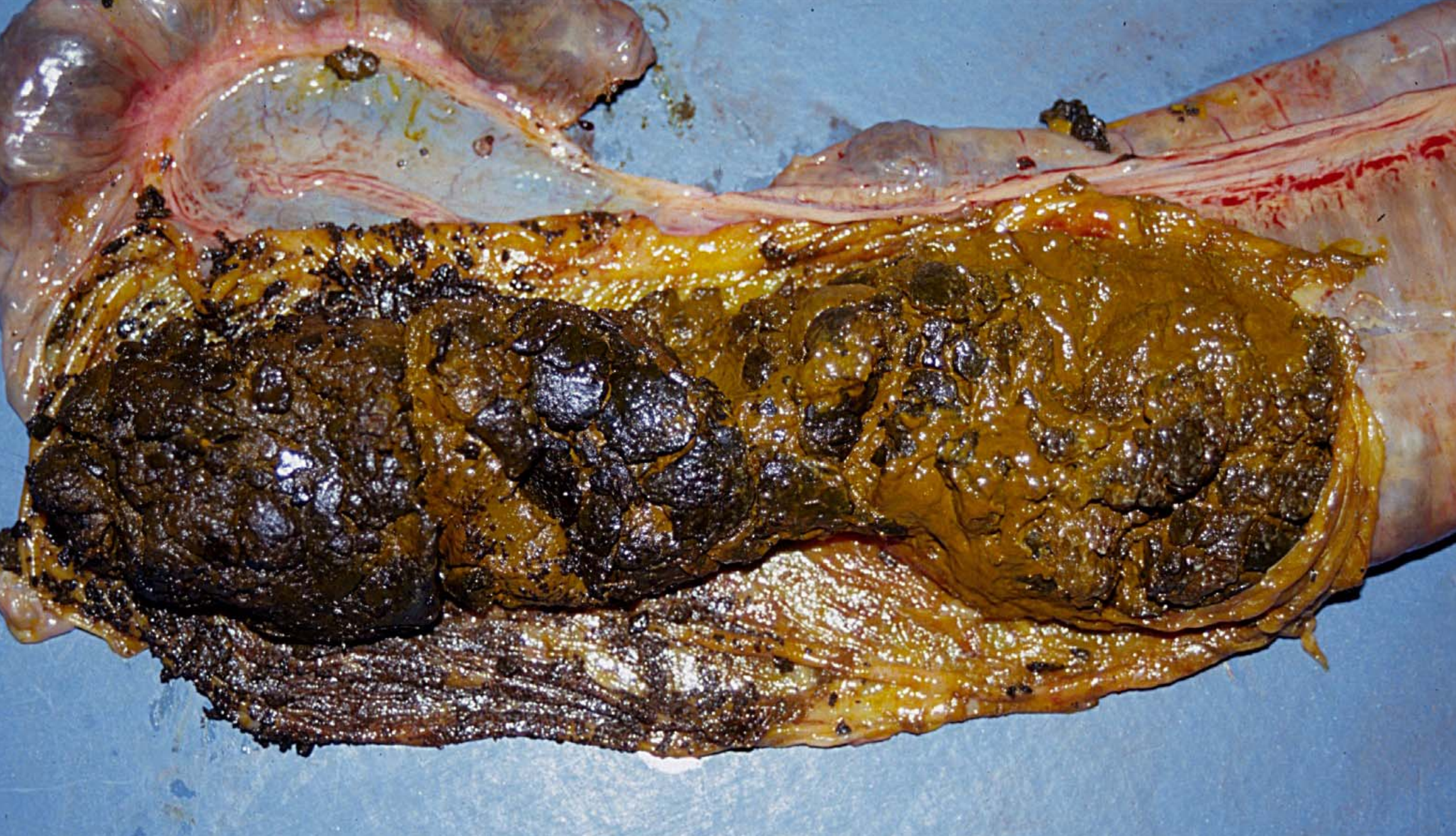
Overo foal – colonic aganglionosis (Hirschprung disease) – severe meconium impaction