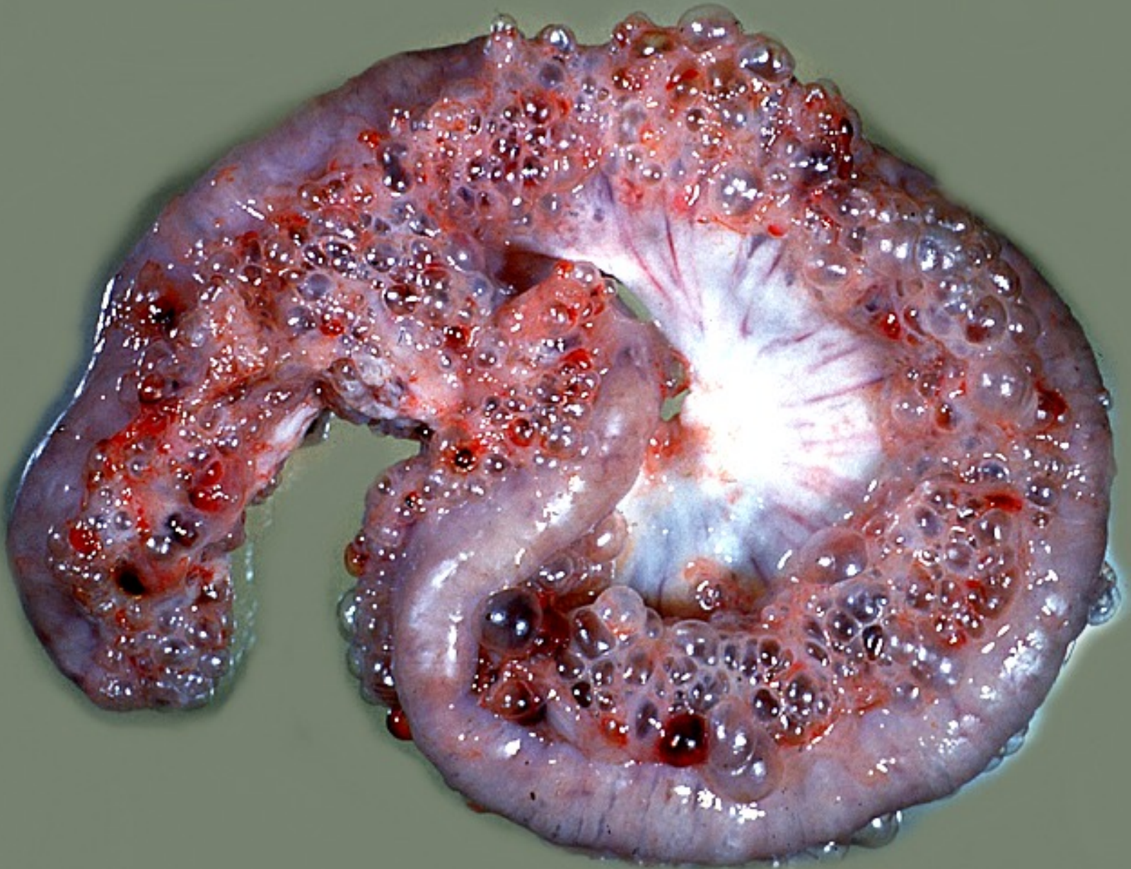
Small intestine – emphysema