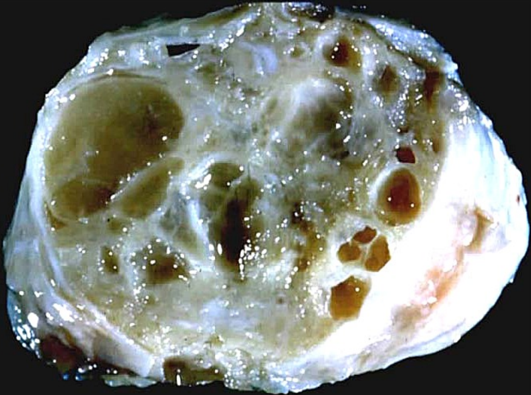
Mesenteric lymph node – emphysema