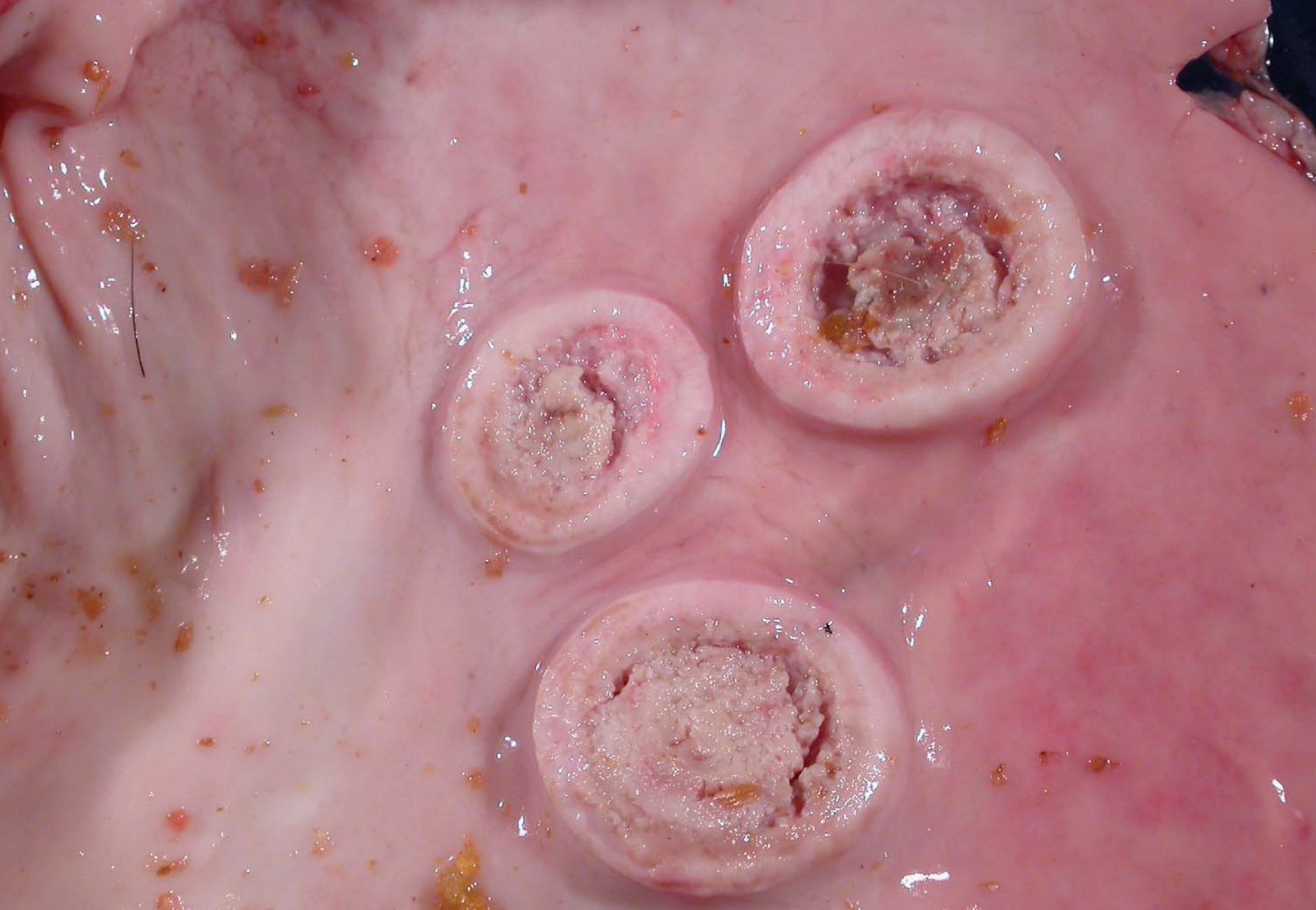
Stomach – lymphoma