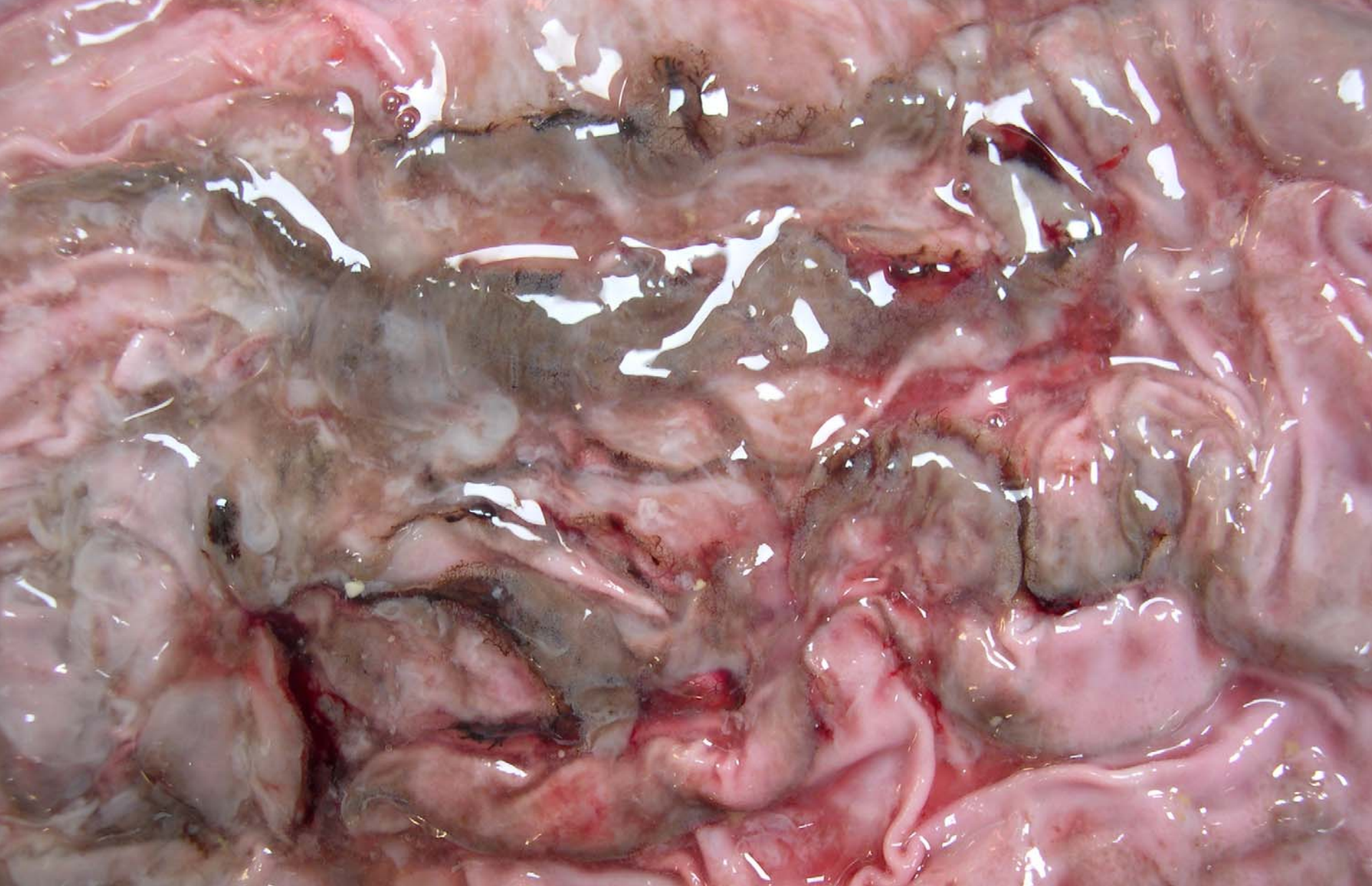
Calf - Abomasum – Linear ulcers and edema – sepsis, inanition, stress, other