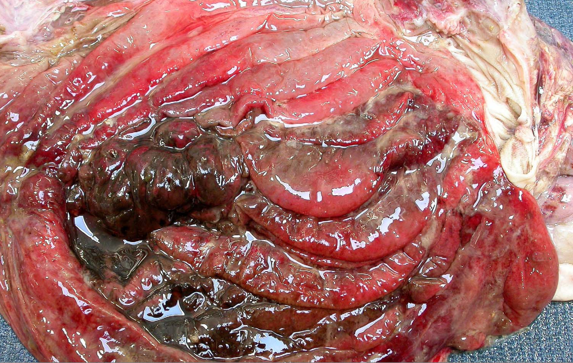
Calf - abomasum – hemorrhagic necrosis with perforation – Braxy-like – Clostridium spp. (presumptive) and Sarcina spp.