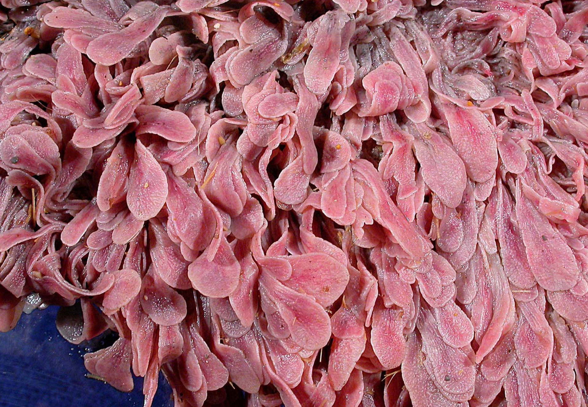
Rumen – hypertrophic papillae - less fiber in diet