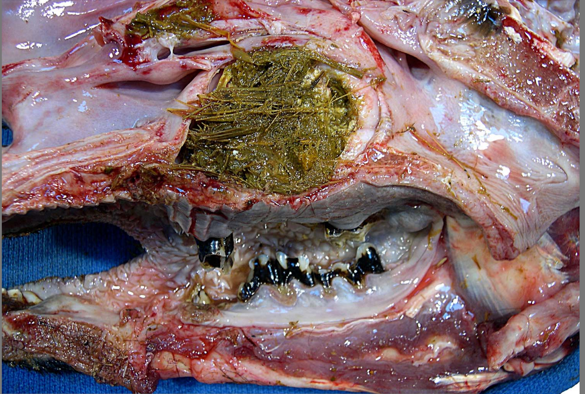
Goat. Molar loss with buccal dorsal intranasal diverticulum