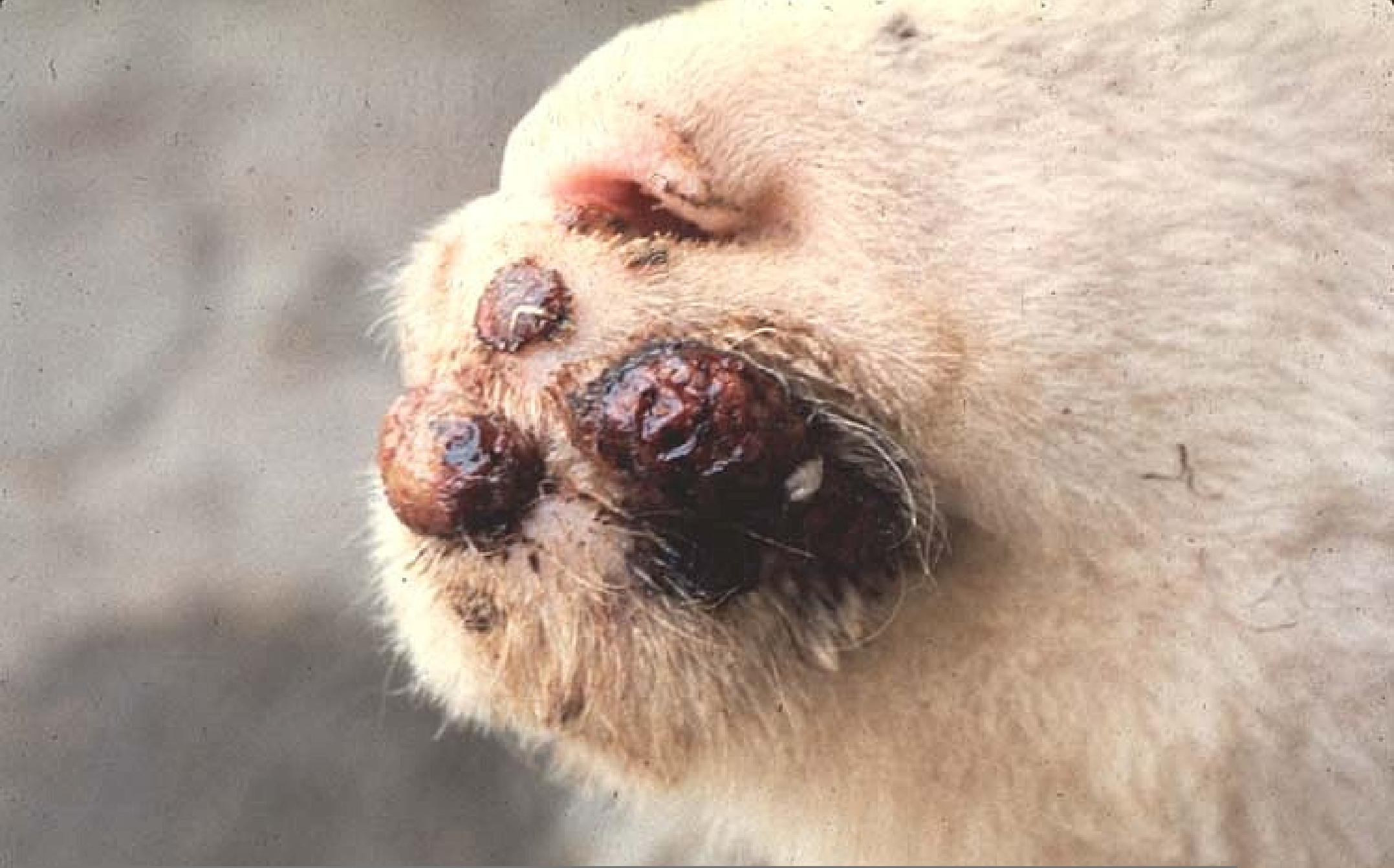
Goat. Papular cheilitis. Contagious echthyma (orf) - parapoxvirus