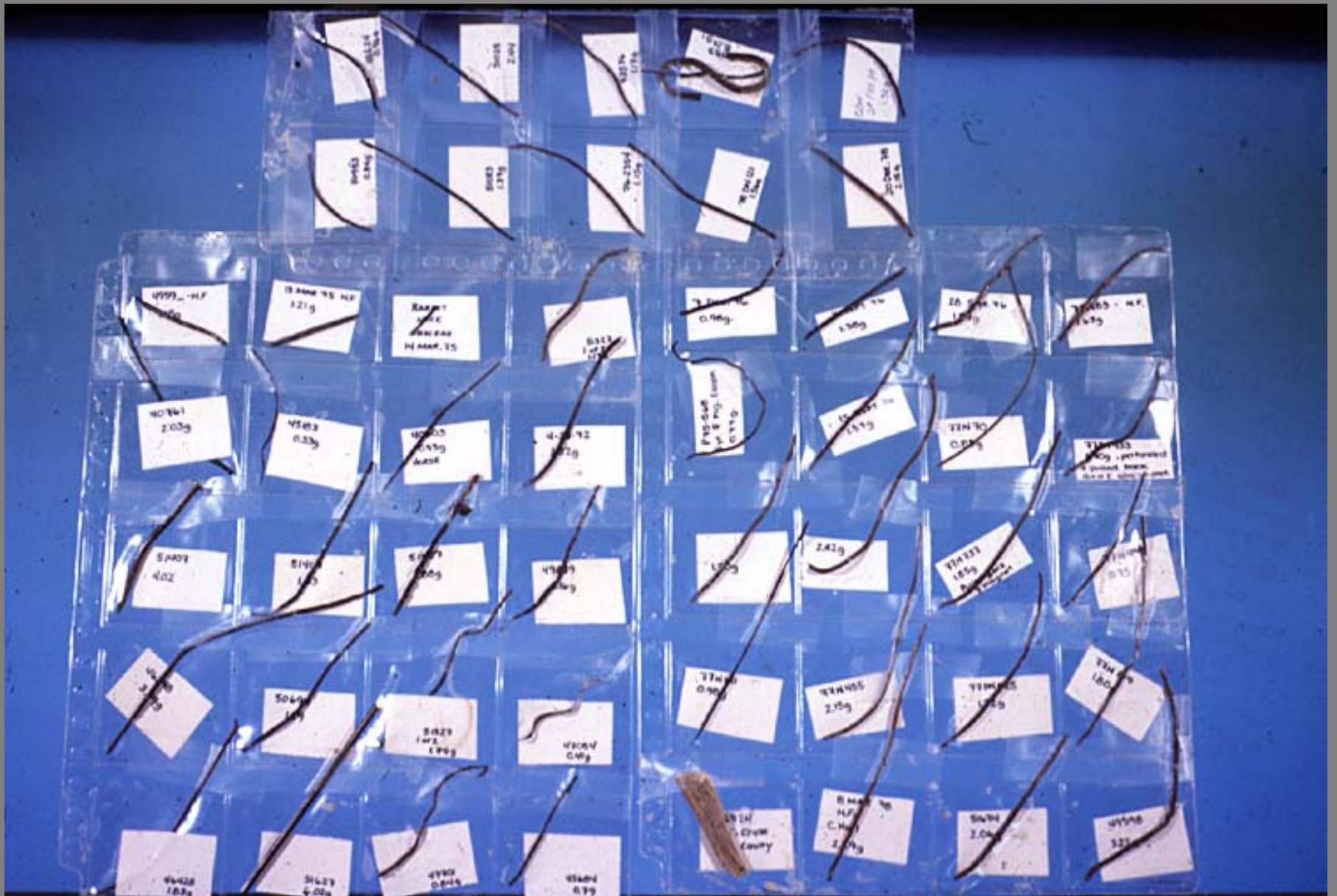
Famous John King hardware collection