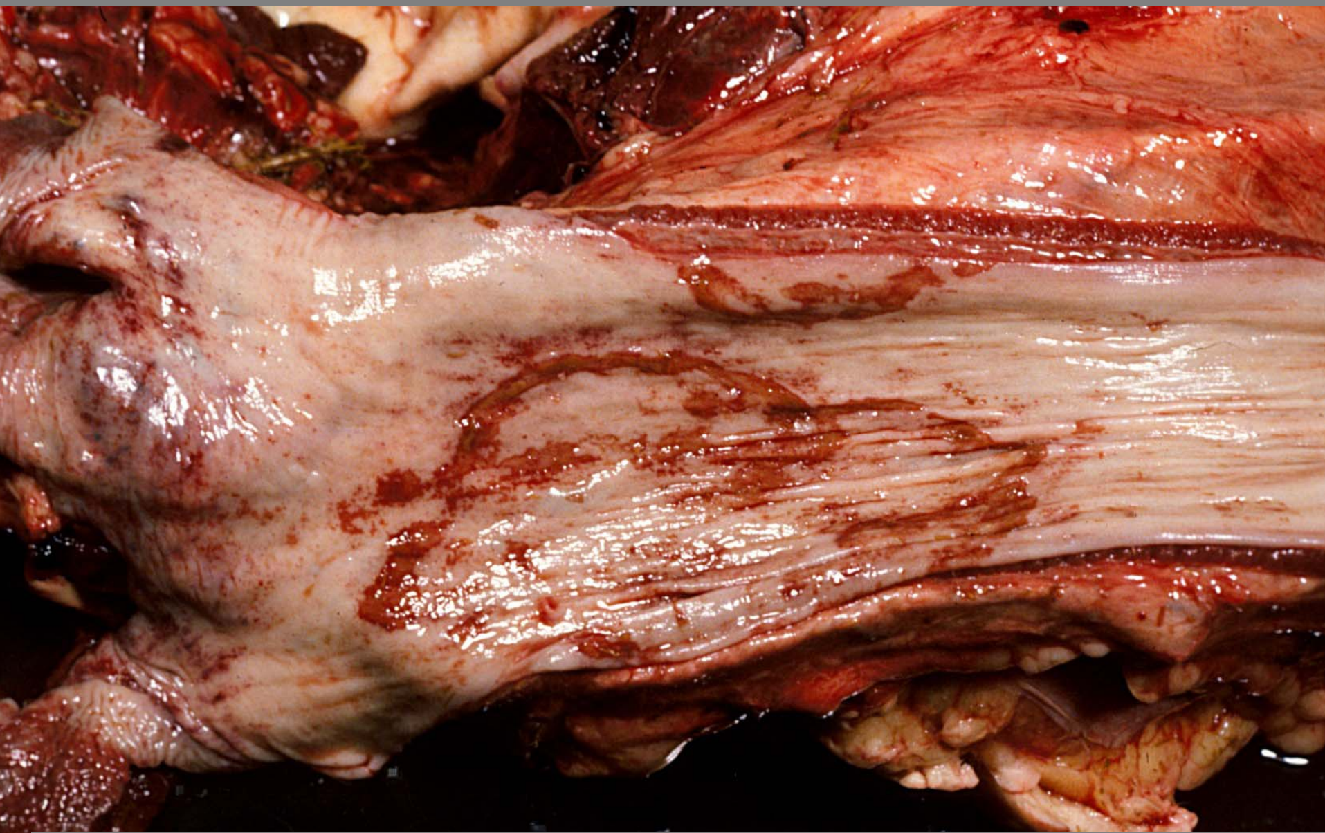
Esophagus – erosive, ulcerative esophagitis – MCF herpesvirus