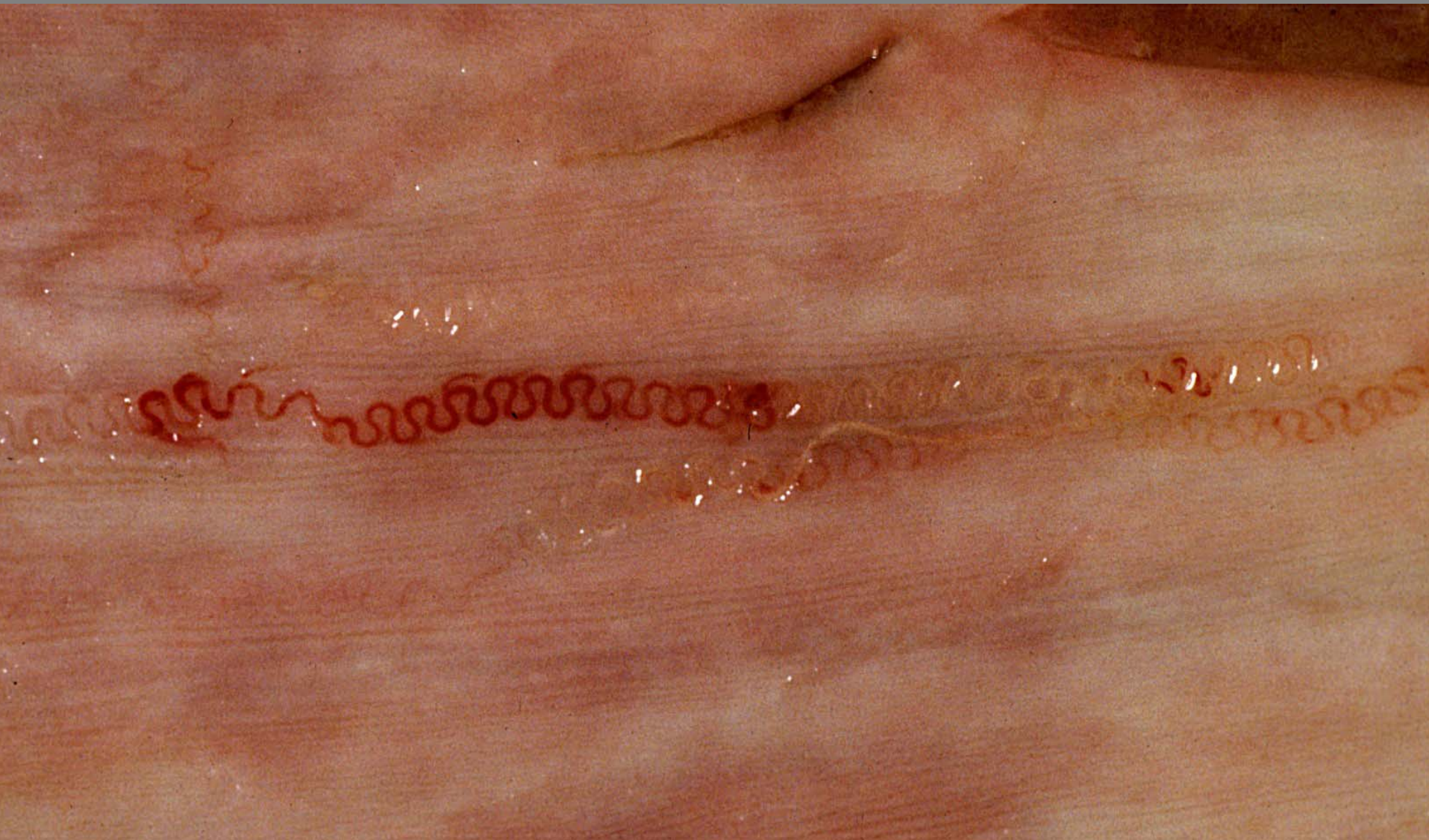
Esophagus – Gongyilonema pulchrum