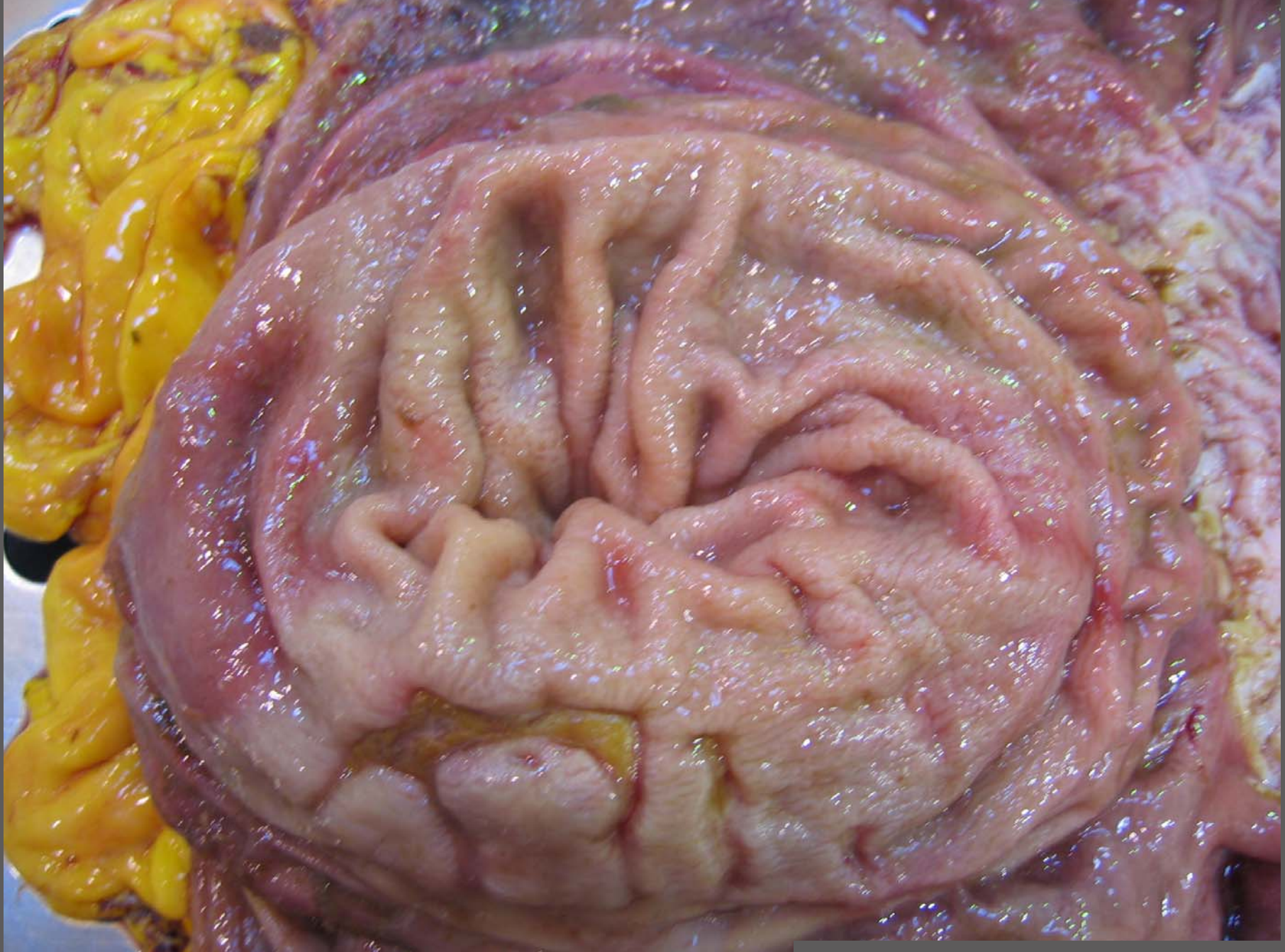
Stomach – pylorus ulcers