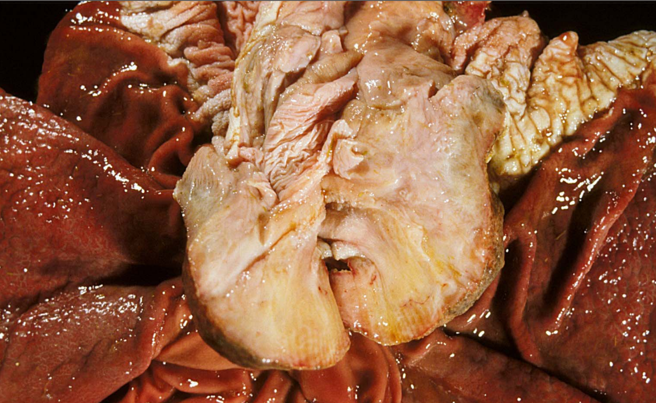
Stomach – squamous cell carcinoma