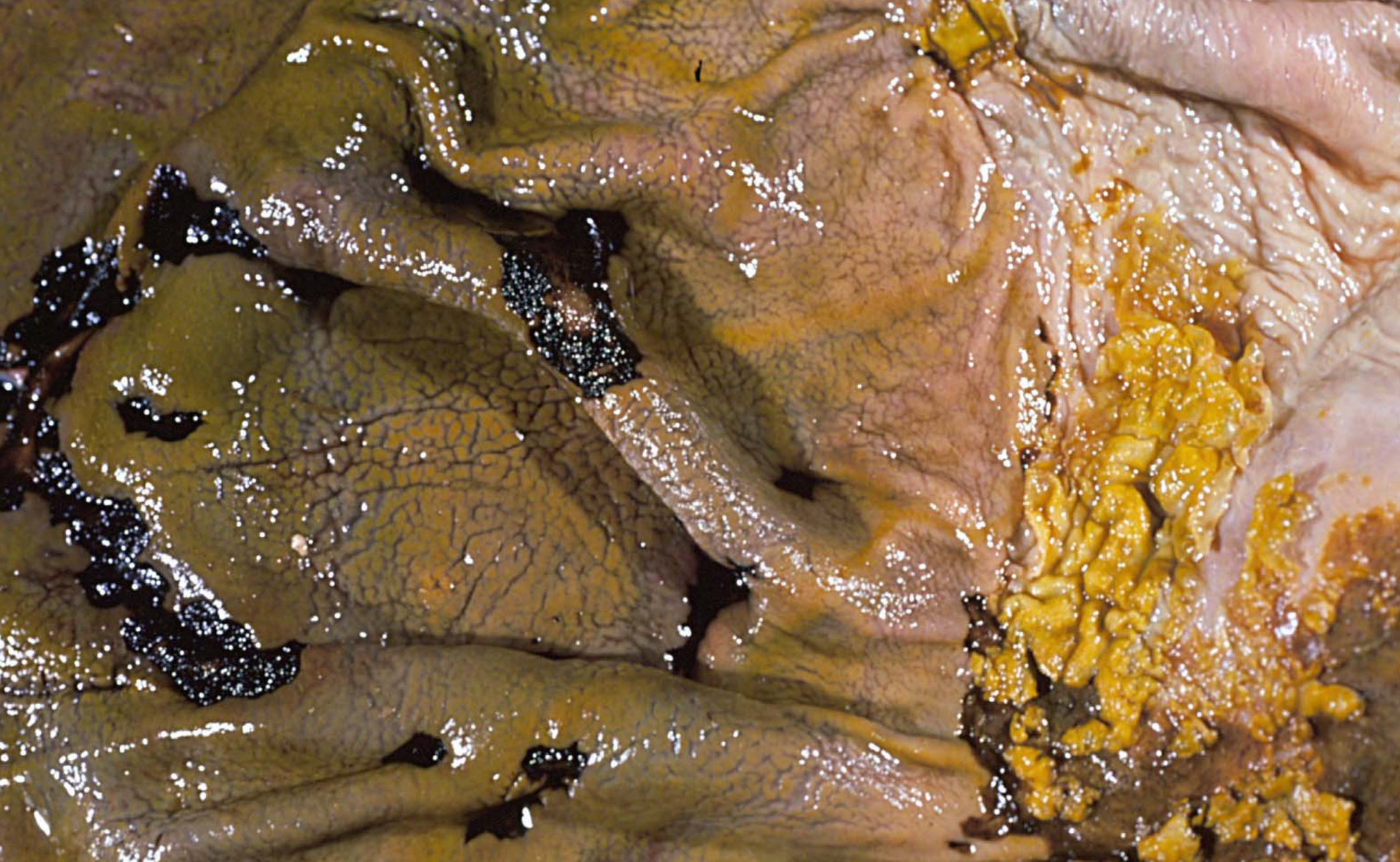
Stomach – chronic ulceration with bleeding– NSAID in this case