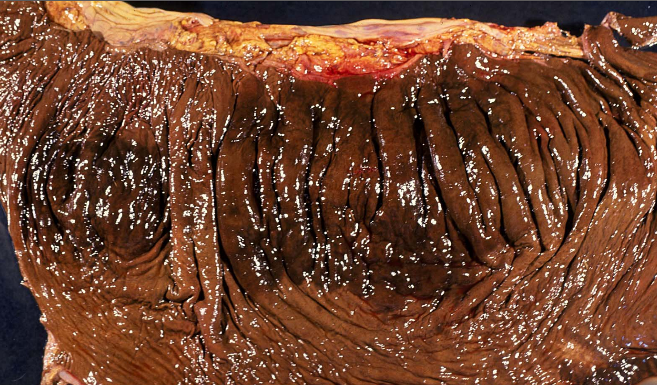
Colon – full thickness hemorrhagic necrosis – NSAID