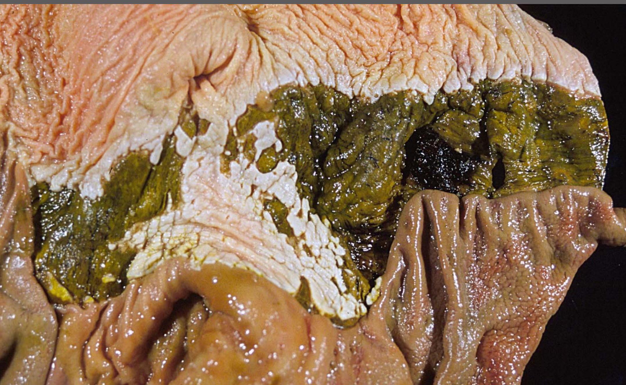
Stomach – extensive pars squamosa ulceration with perforation