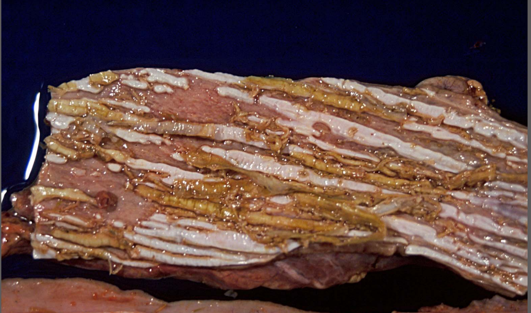
Foal – esophagus – ascending esophageal linear ulceration secondary to gastric abnormal emptying due to duodenal stenosis secondary to previous ulceration