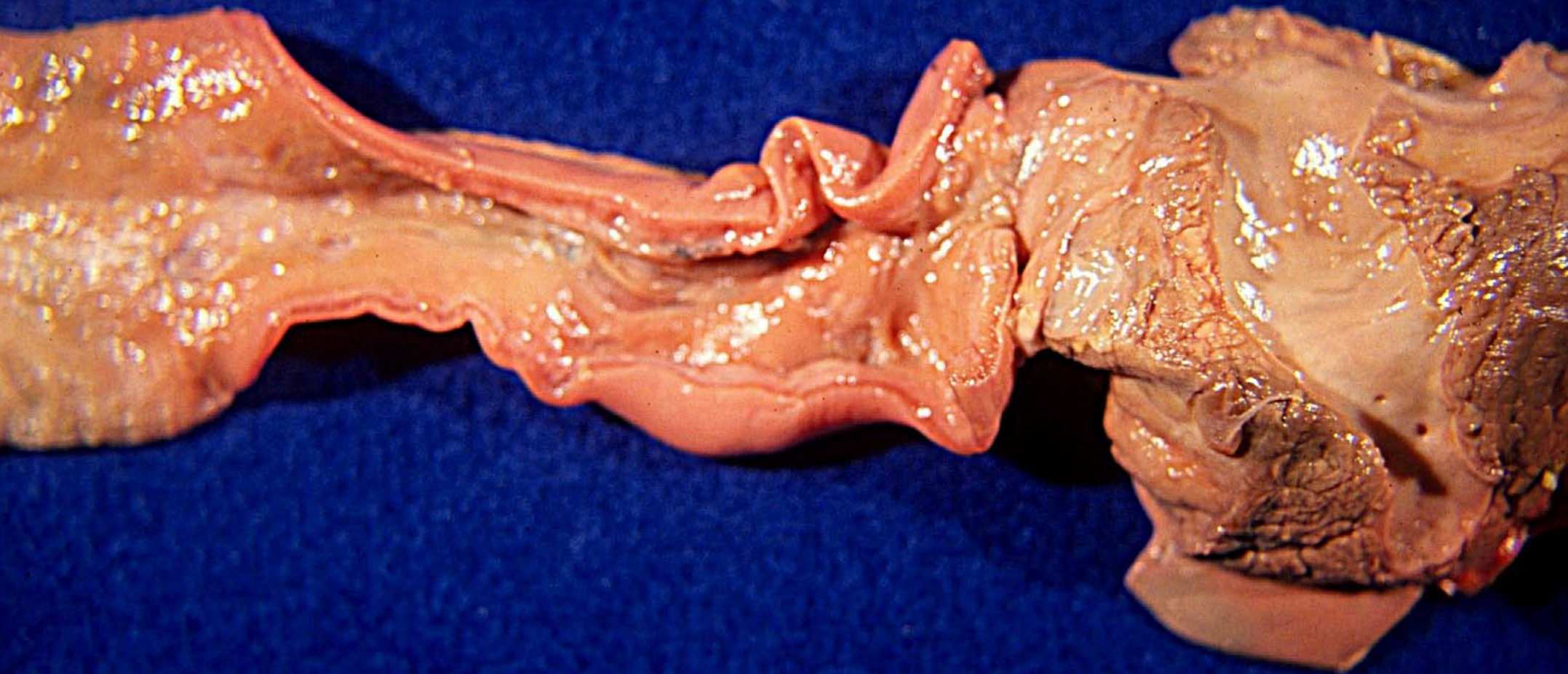
Foal – duodenum – stenosis with pancreatic duct dilatation