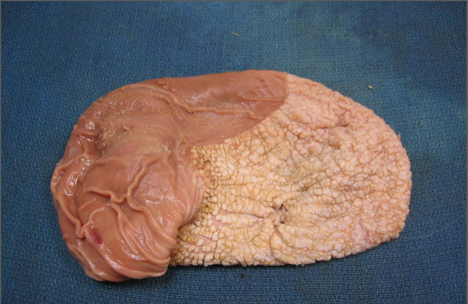
Foal – stomach – erosions, ulcers and cobblestone hyperkeratosis