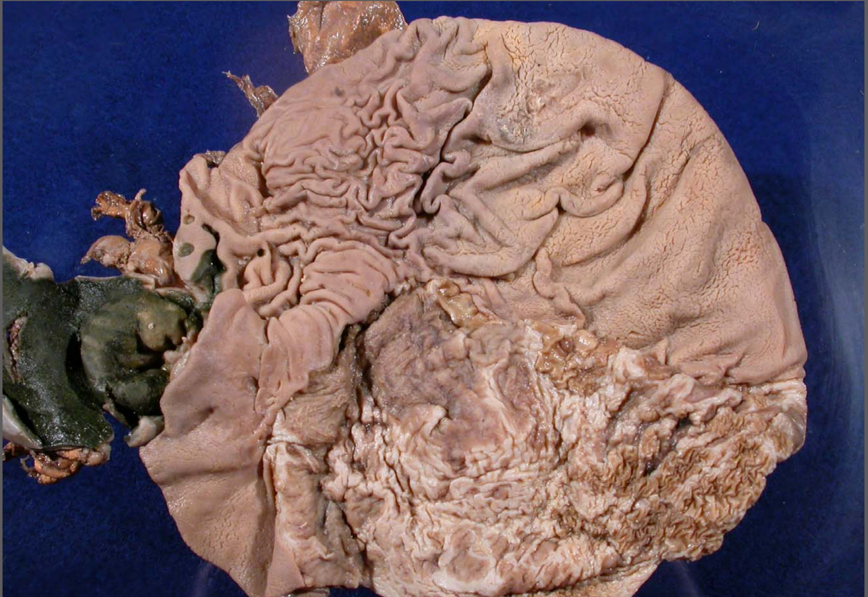
Foal – stomach, duodenum – erosions, ulcers with duodenal ulceration and perforation