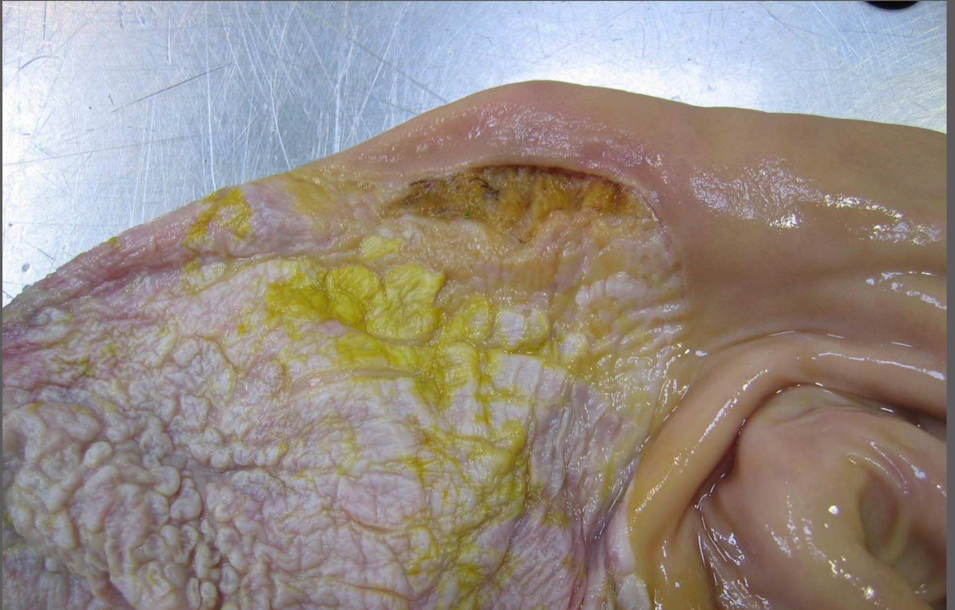
Foal – stomach – erosions, ulcers, cobblestone hyperkeratosis and perforation