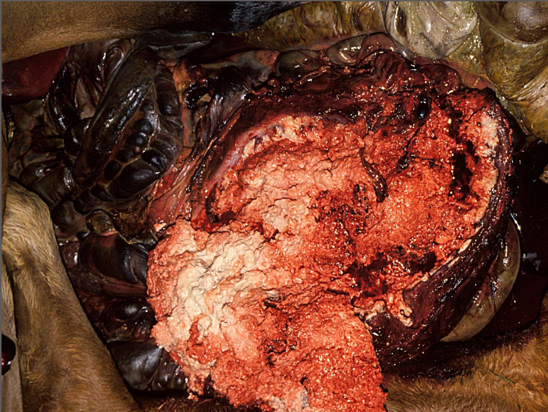
Foal – Mesenteric lymph node caseous necrosis – Rhodococcus equi