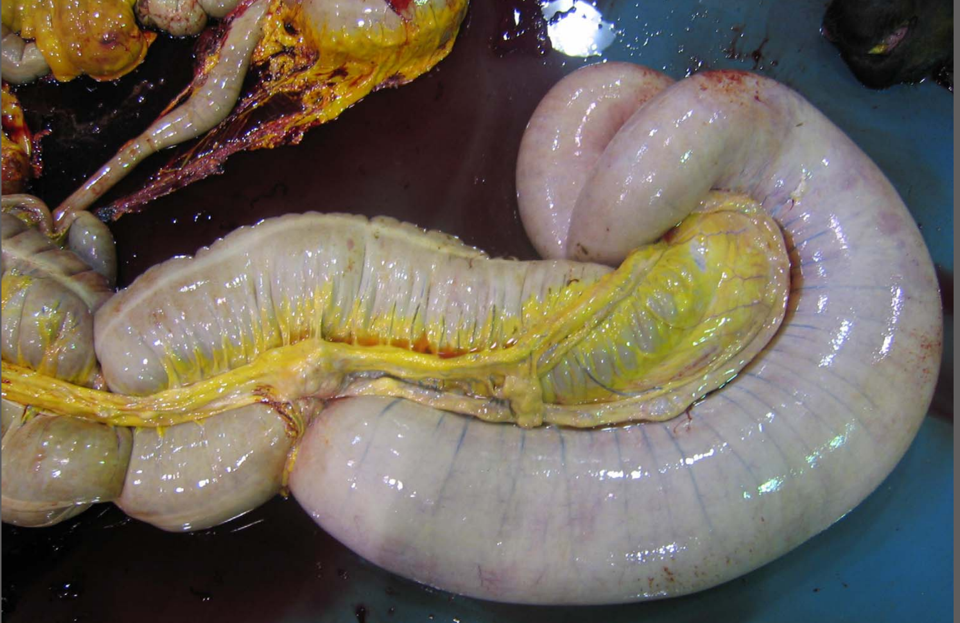
Colon – Adenocarcinoma with stenosis, impaction, and diffuse smooth muscle hypertrophy/hyperplasia and lymph node metastasis