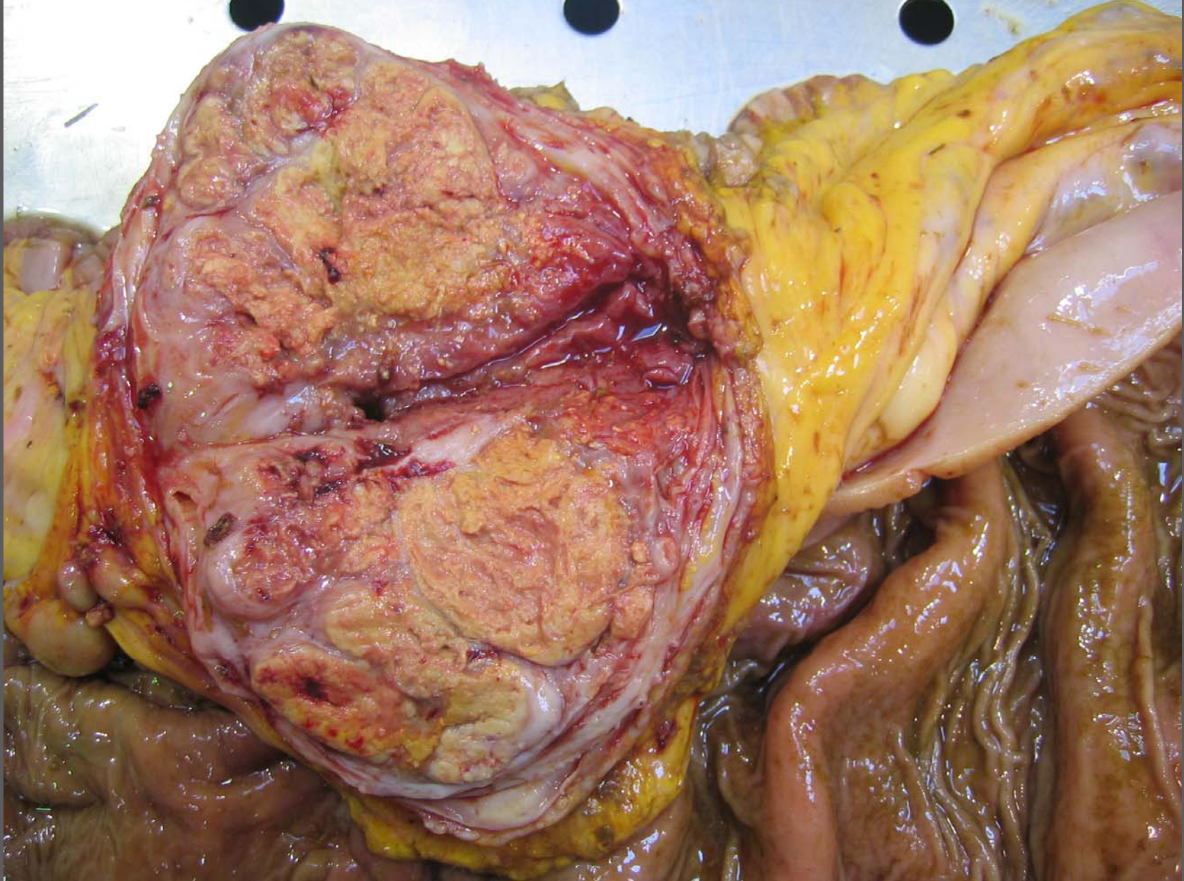
Colon – Adenocarcinoma with stenosis, impaction, and diffuse smooth muscle hypertrophy/hyperplasia and lymph node metastasis