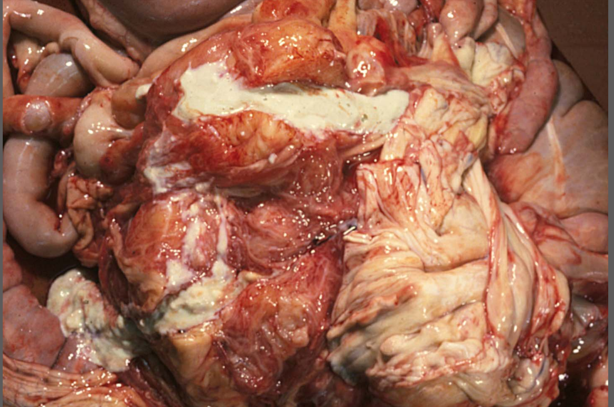
Mesenteric lymph node abscess – Streptococcus equi equi