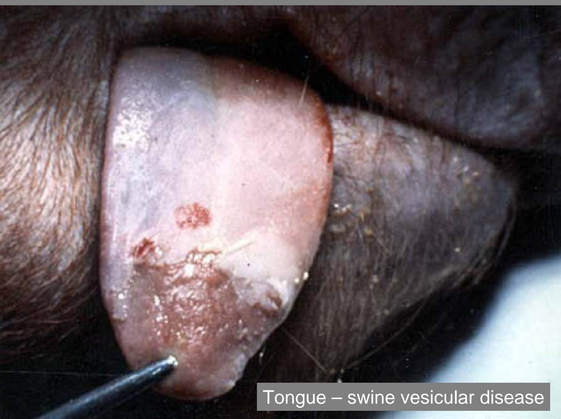
Tongue – swine vesicular disease