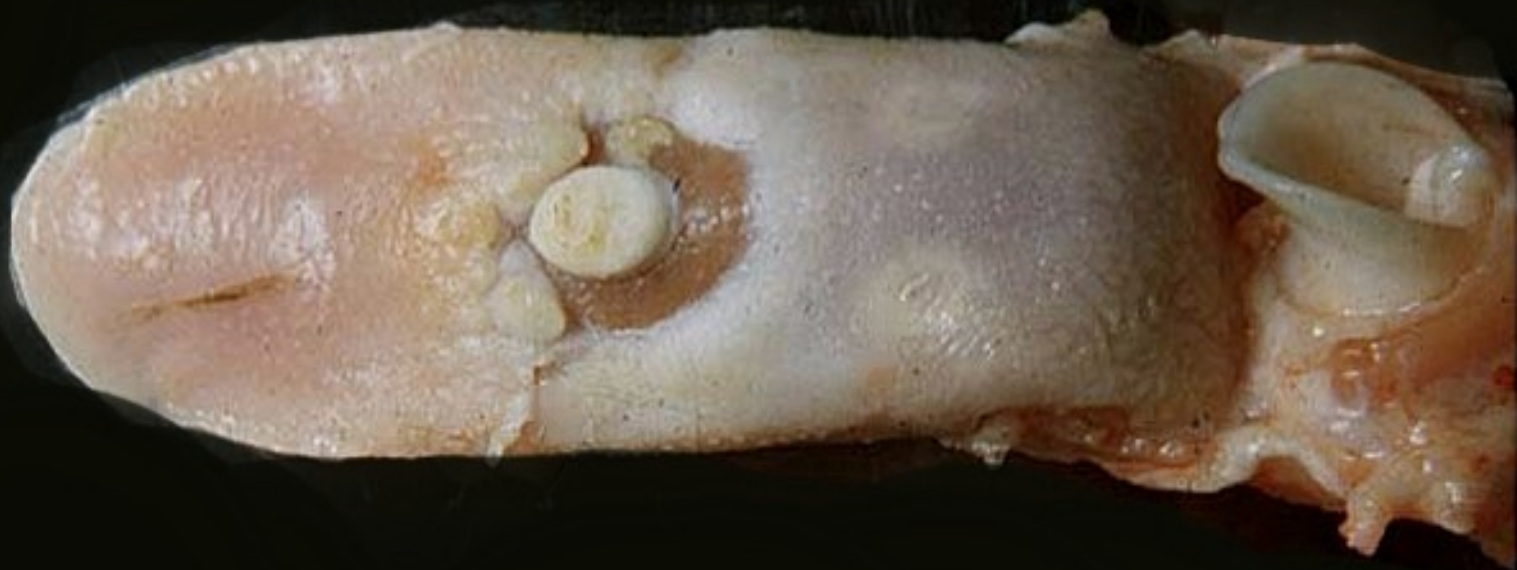
Tongue – epitheliogenesis imperfecta