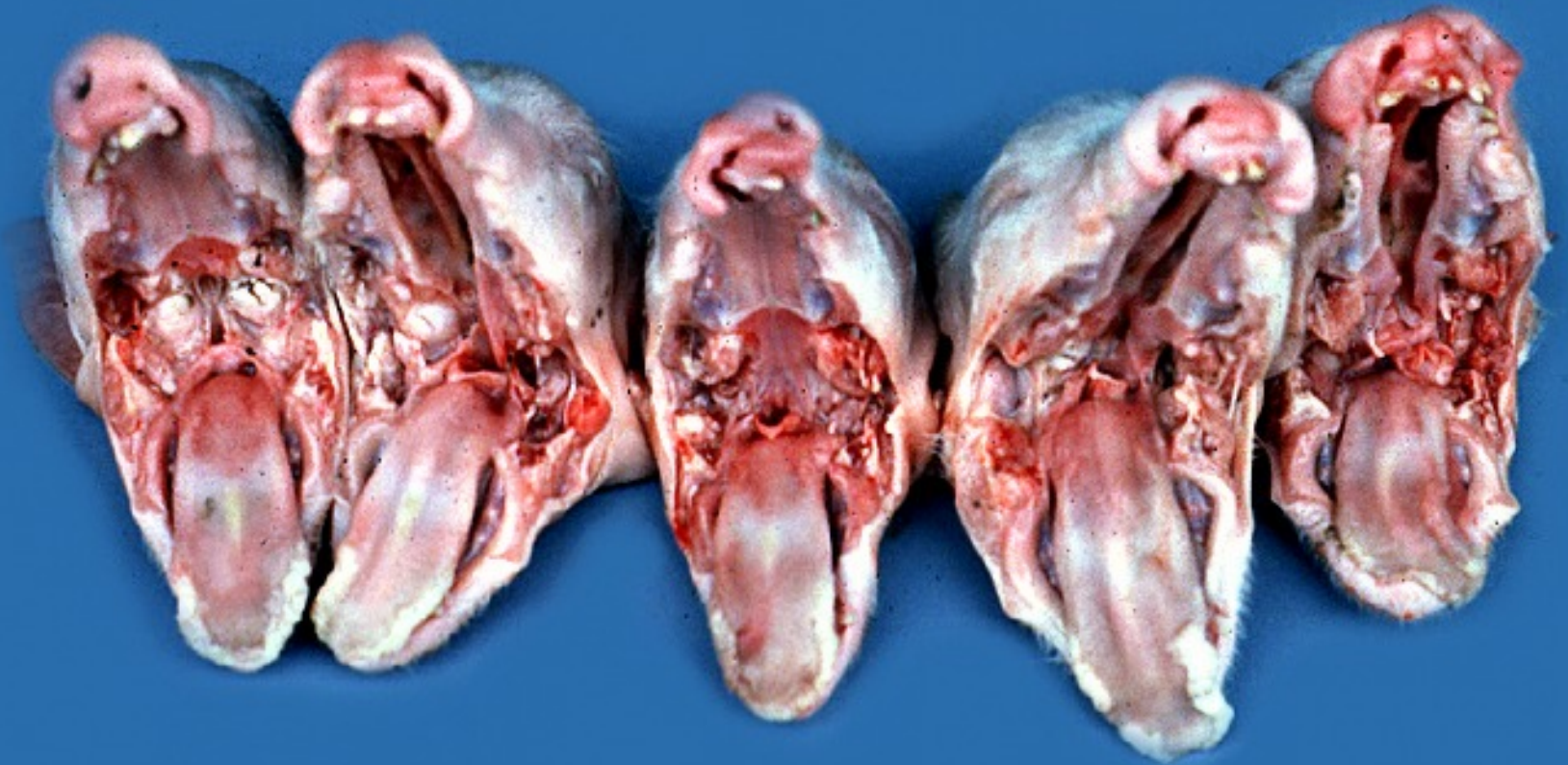
Piglets – palatoschysis