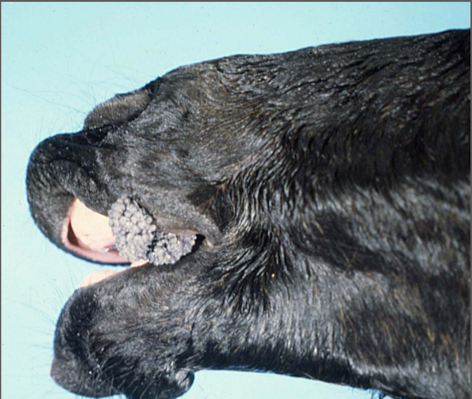
Fetus – labial papillomata