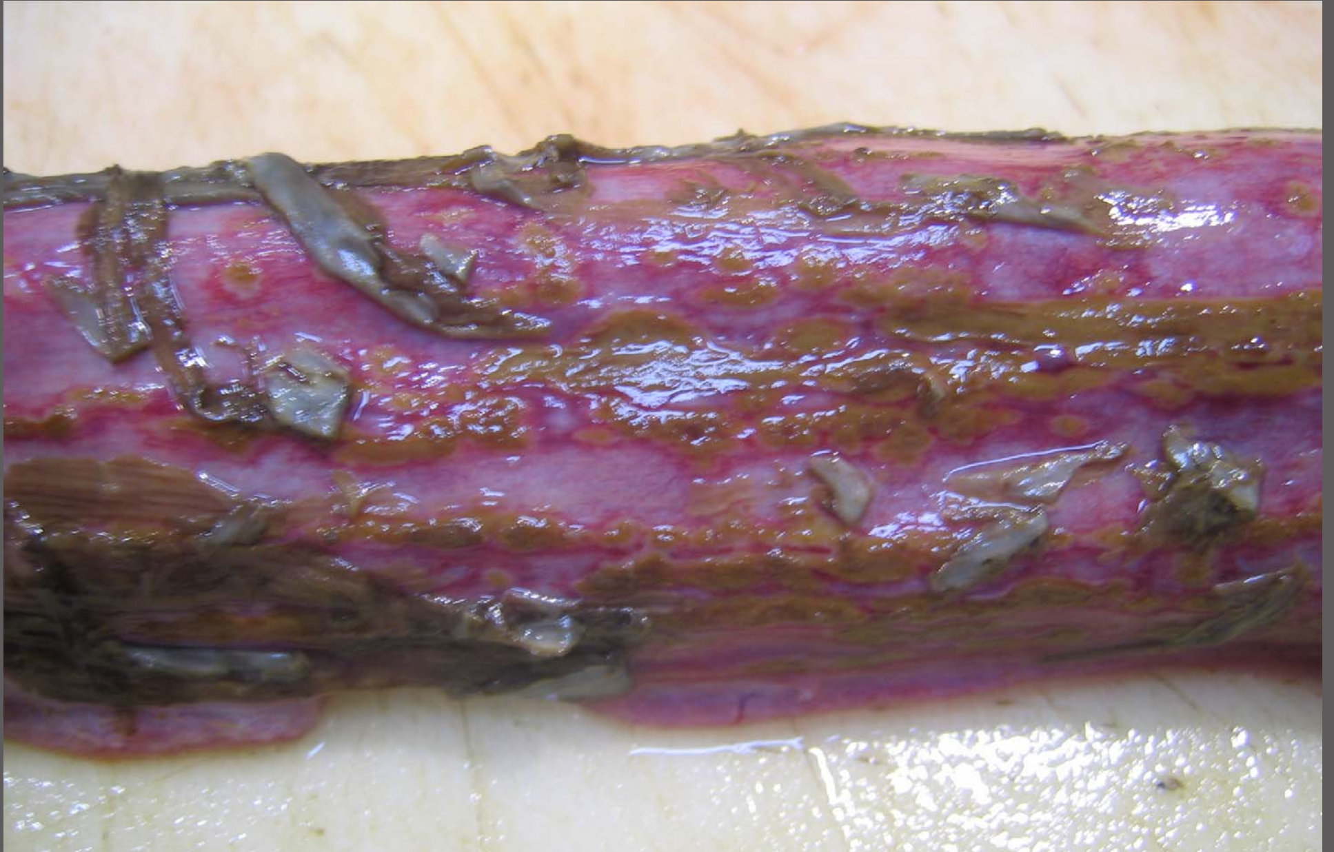
Esophagus – parakeratosis – opportunistic Candida spp. in foal with systemic salmonellosis