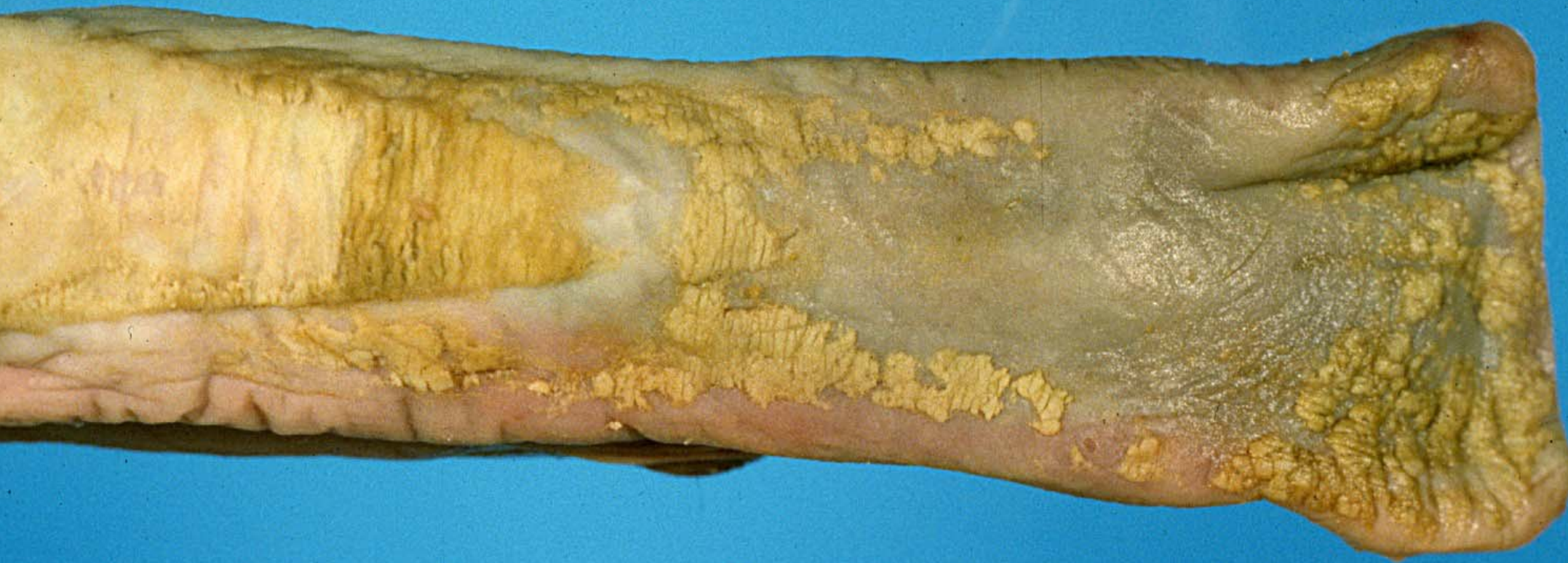
Tongue – parakeratosis – opportunistic Candida spp.