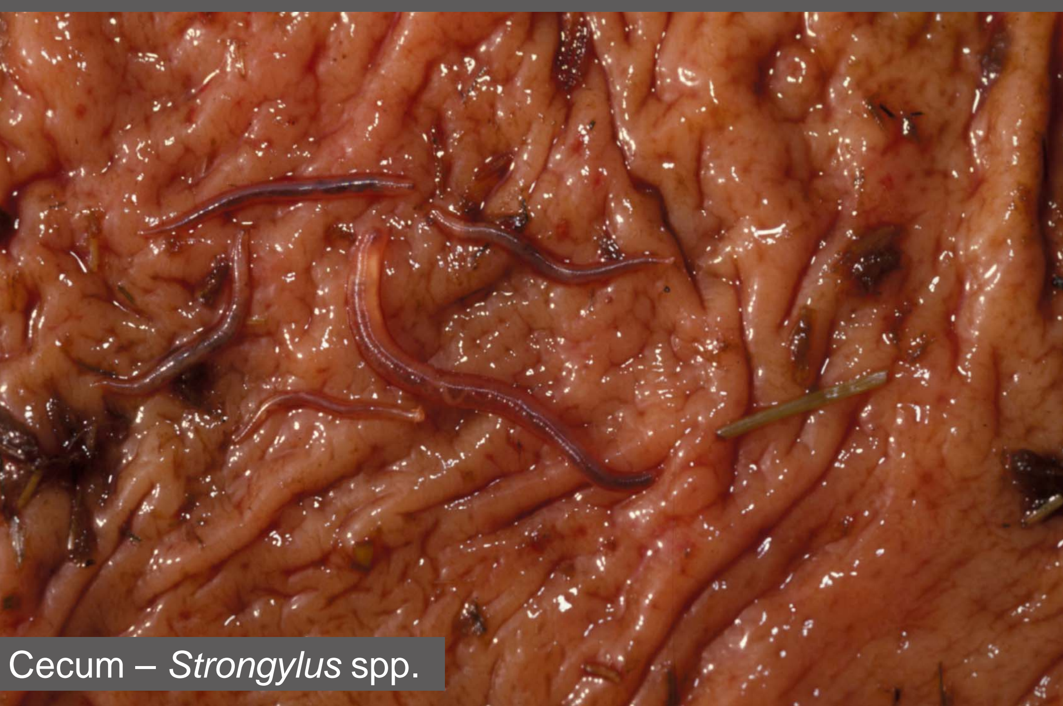
Cecum – Strongylus spp.