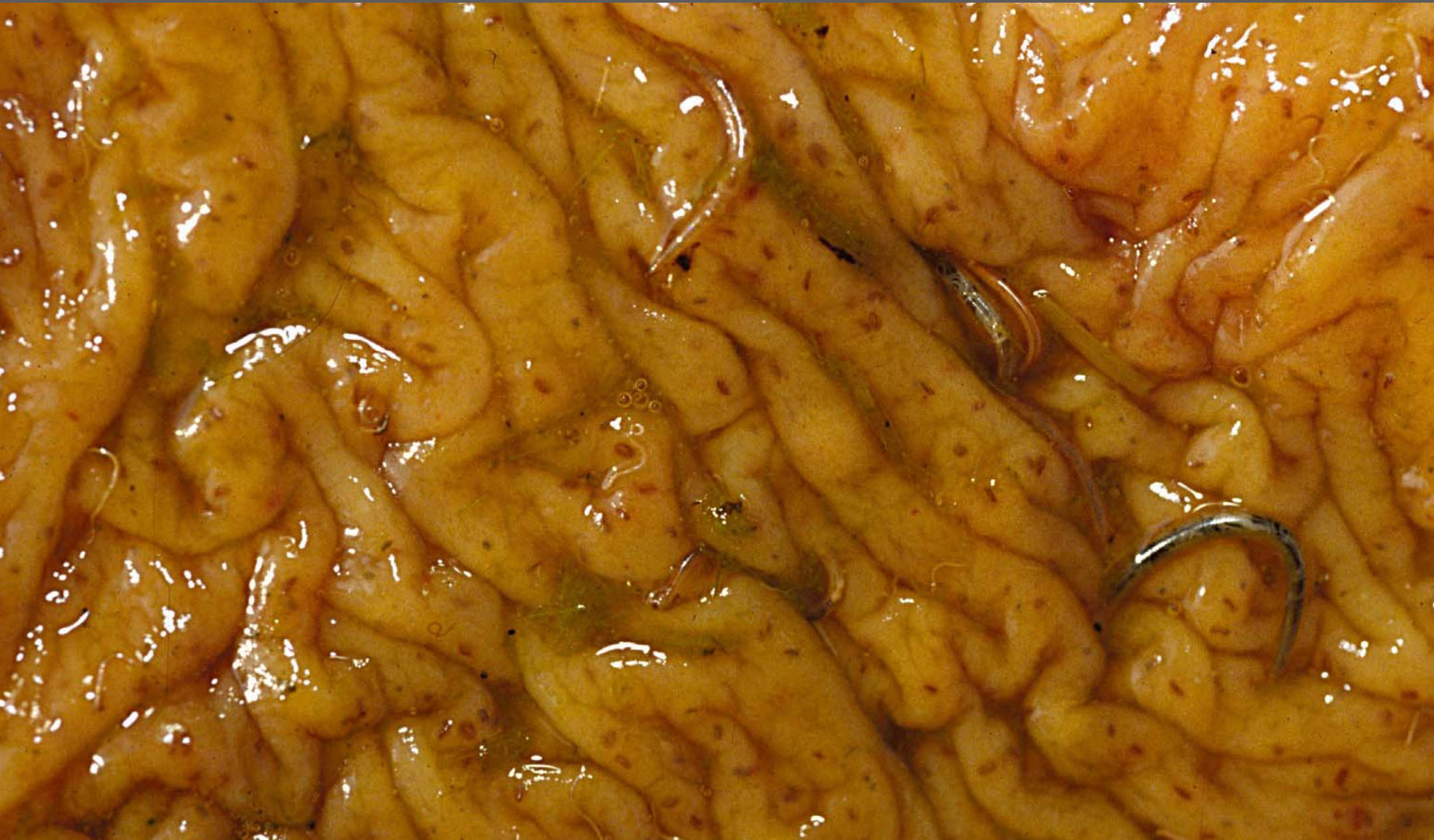
Large intestine – Strongylus spp. adults and Cyathostomidae adults and encysted larvae