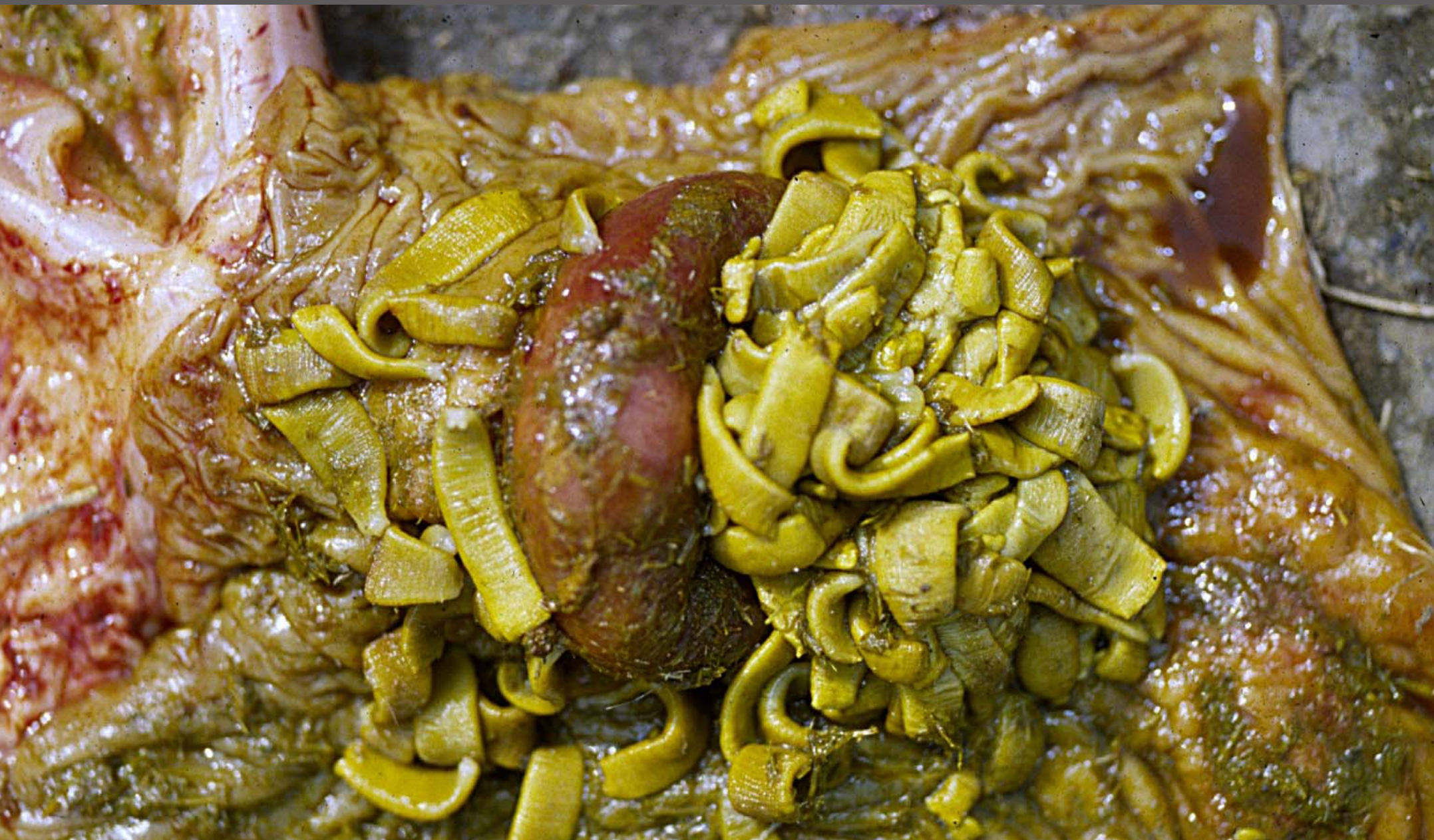
Ileocecal valve – Severe cestodiasis ( Anoplocephala perfoliata ) with severe edema and ulcerative chronic typhlitis