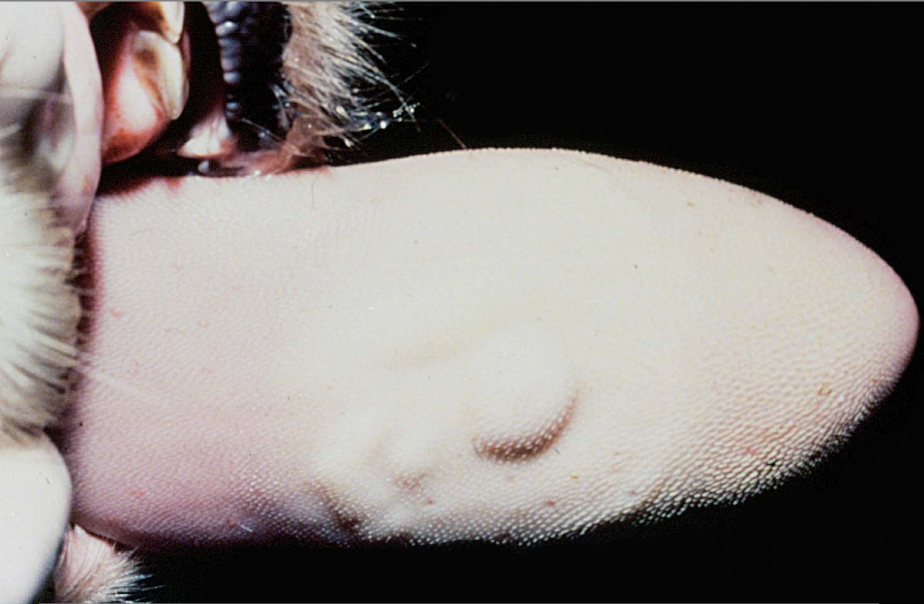
Vesicular glossitis – FMD - aphthovirus