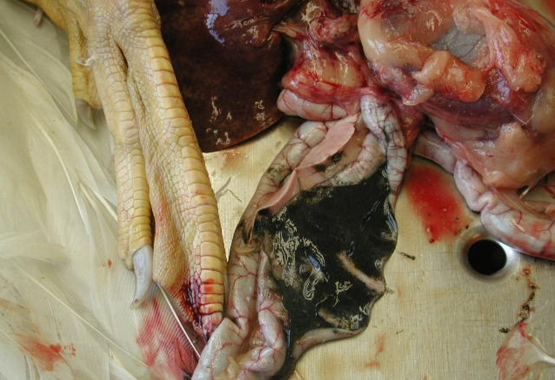
Intestinal necrosis – duck plague herpes virus