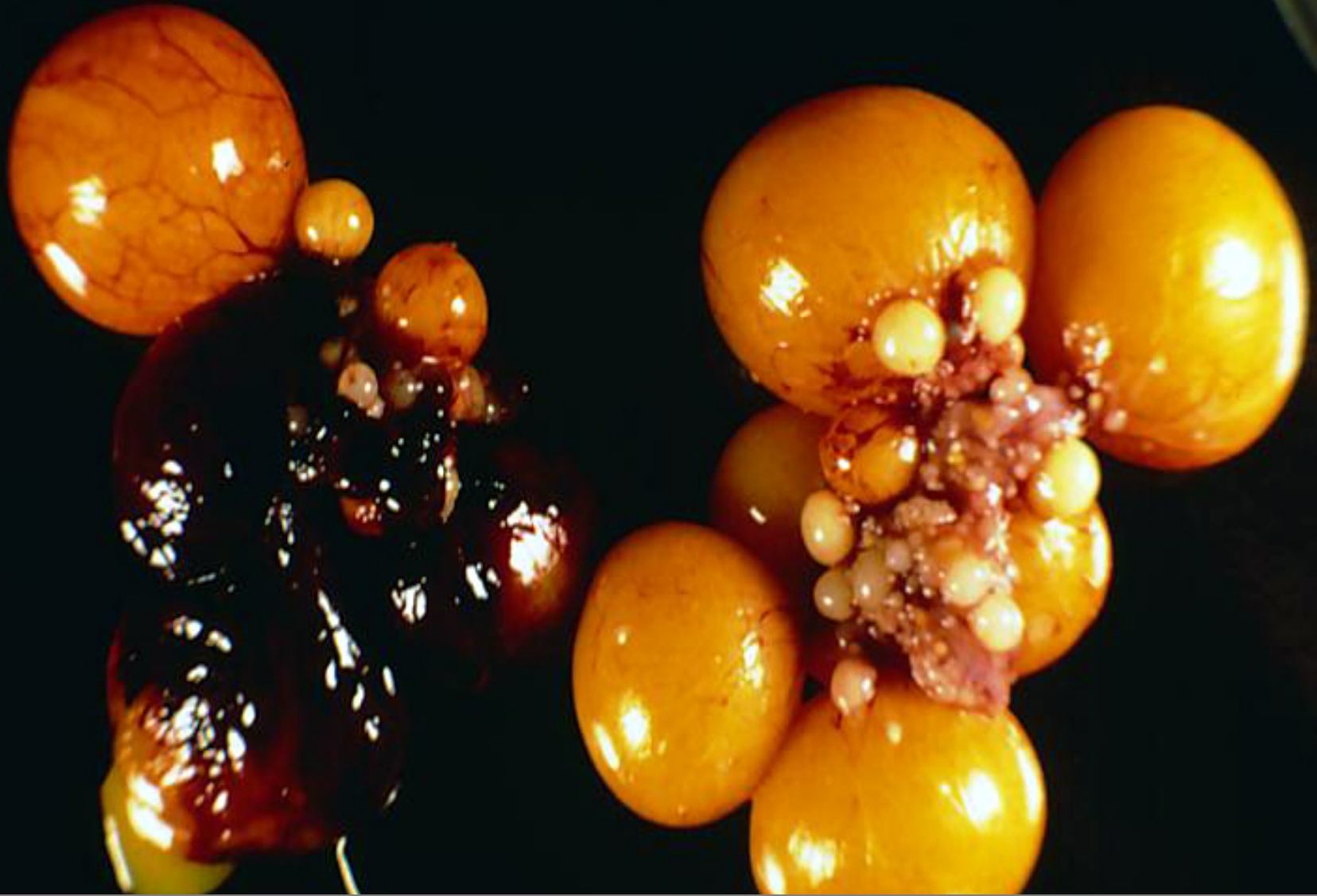
Ovarian hemorrhage – ND