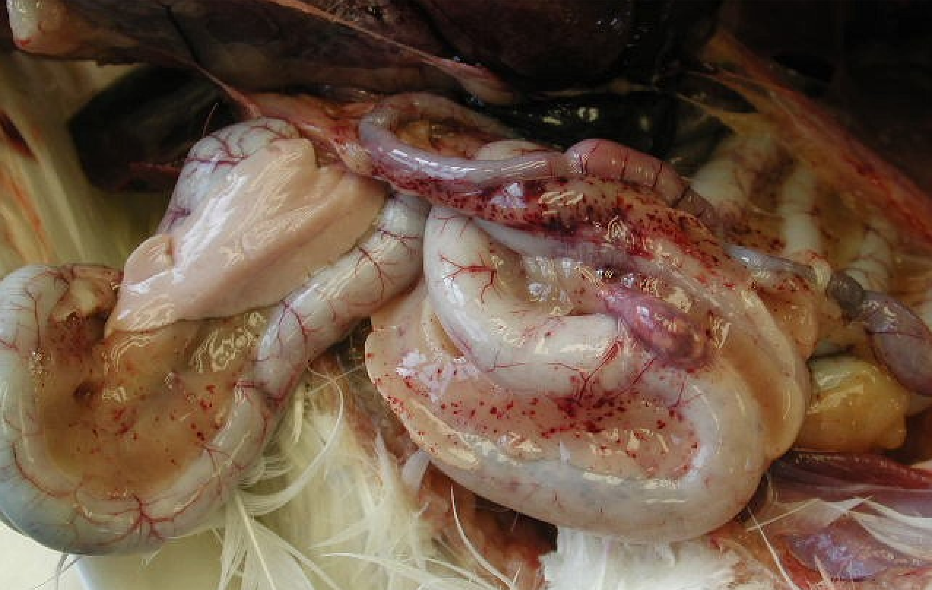
Intestinal and pancreatic hemorrhagic necrosis – duck plague herpes virus