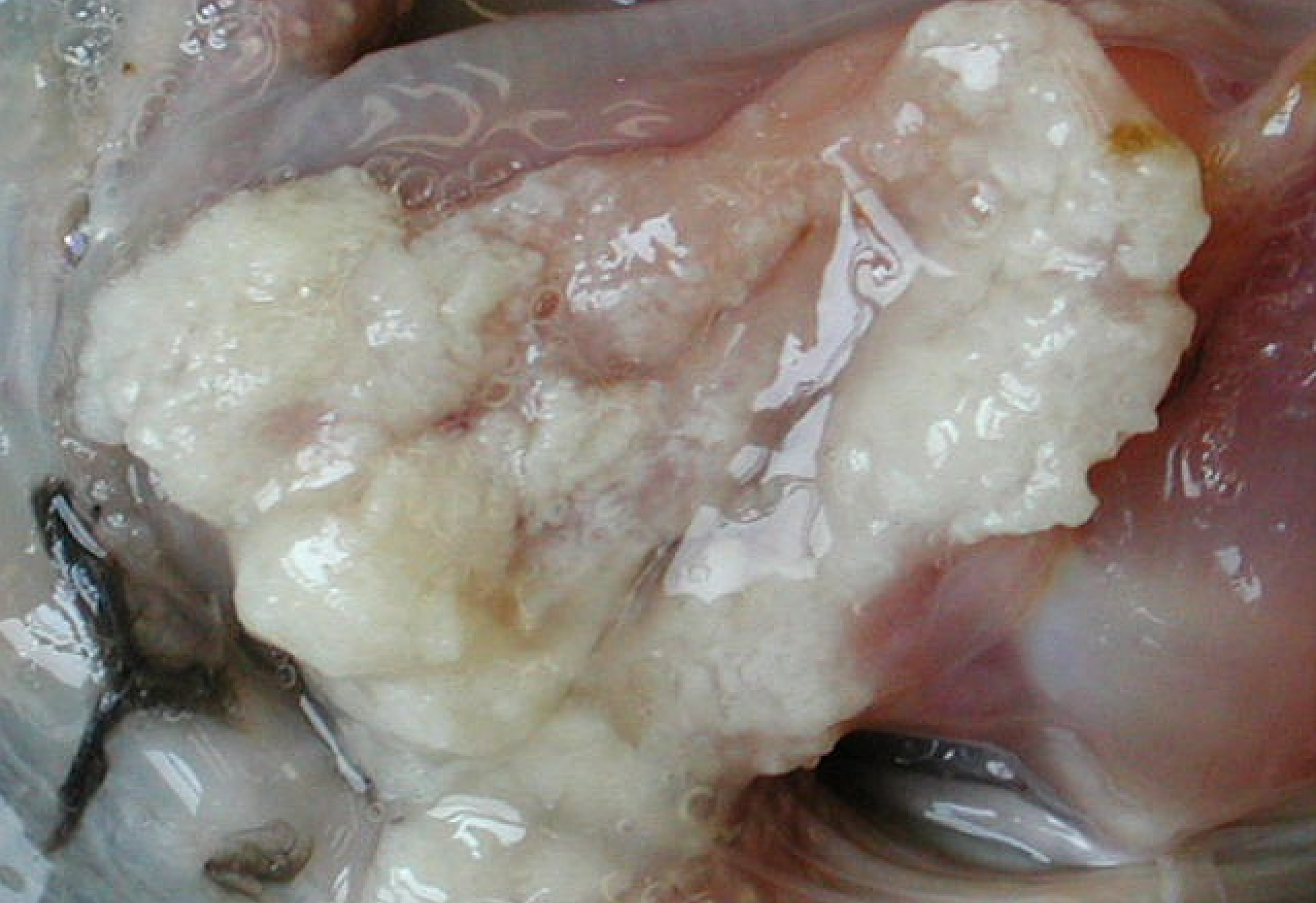
Quail - Ingluvitis - Capillaria