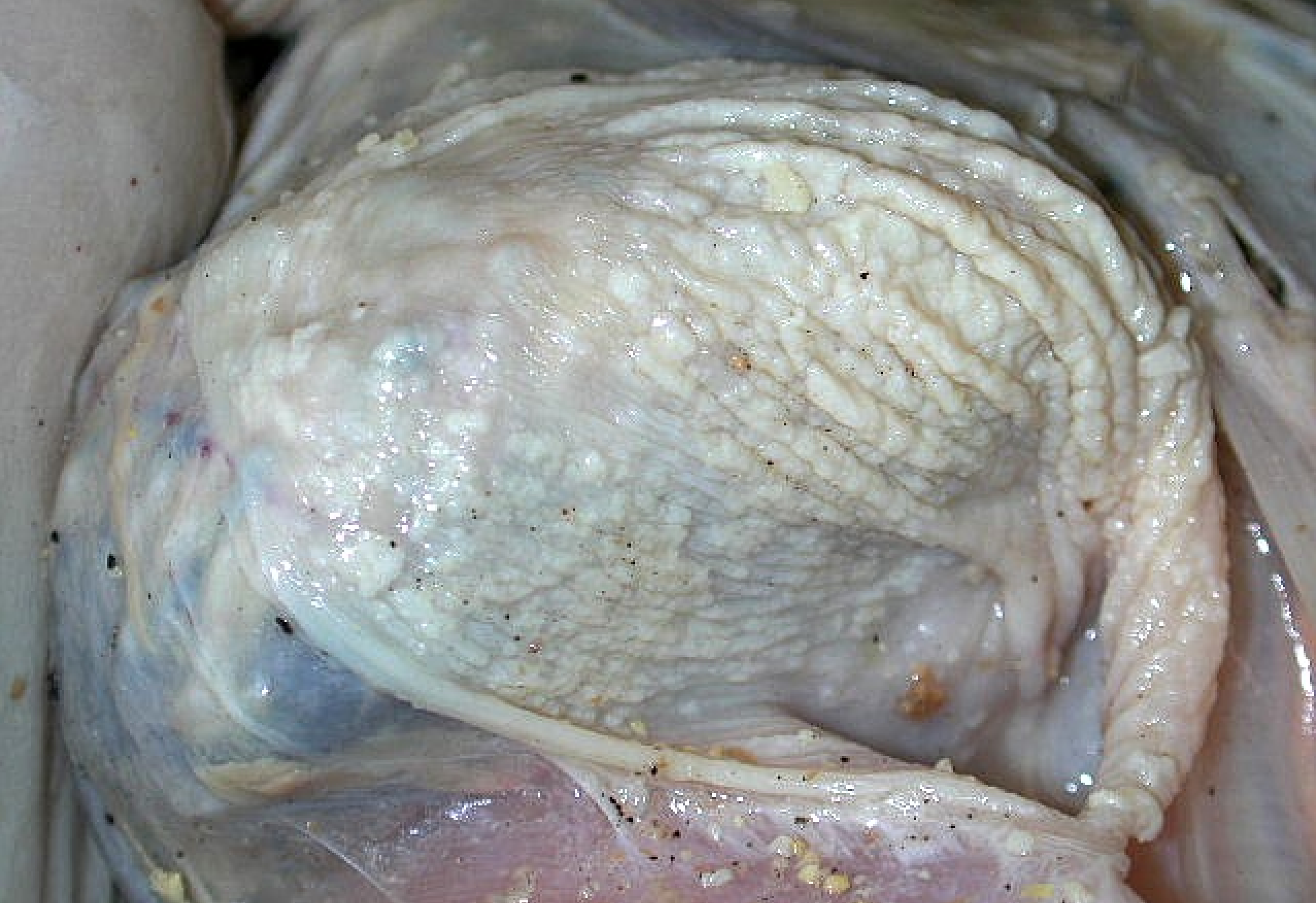
Ingluvitis – Crop mycosis – Candida