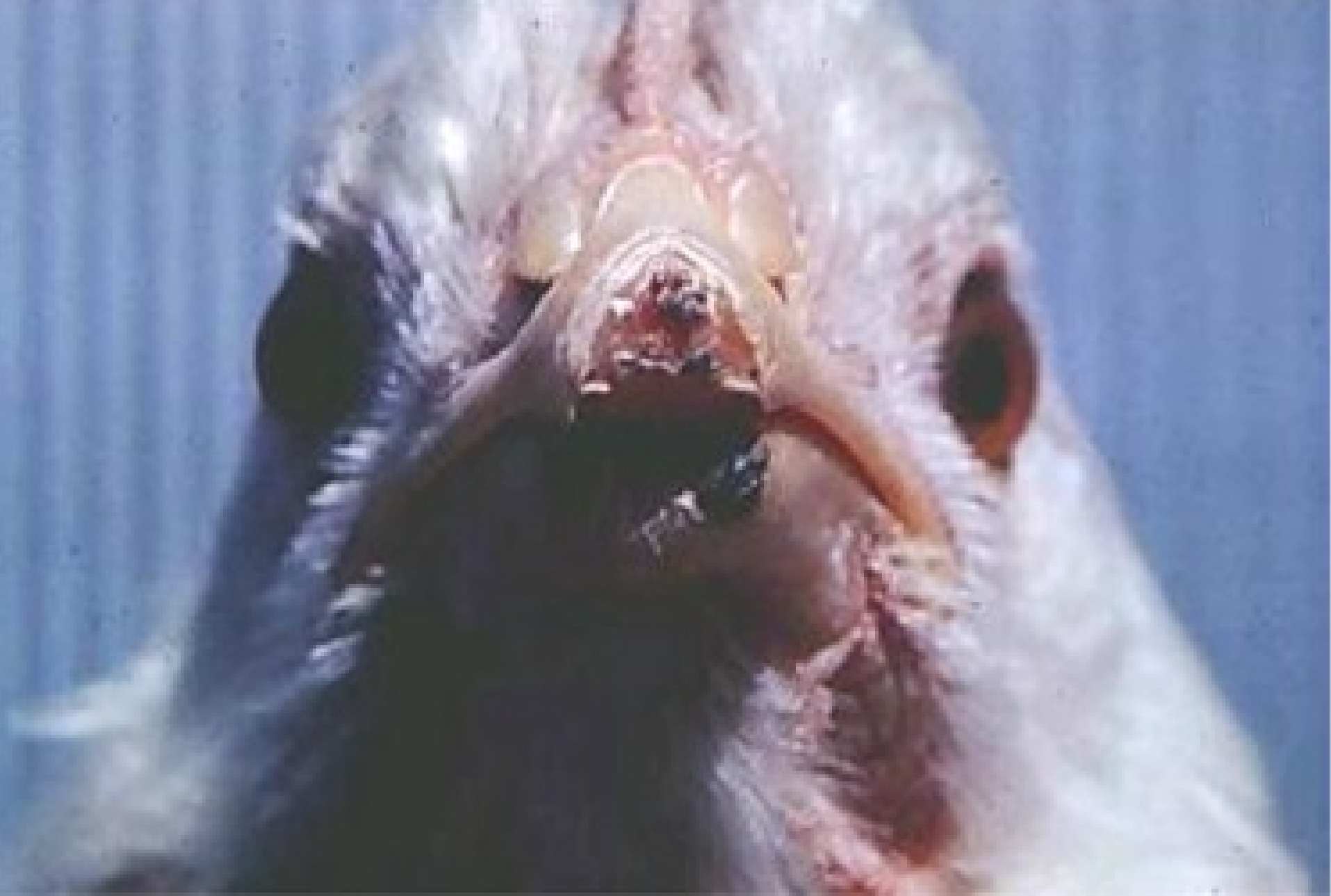
Ramphothecitis - beak trimming - bacteria