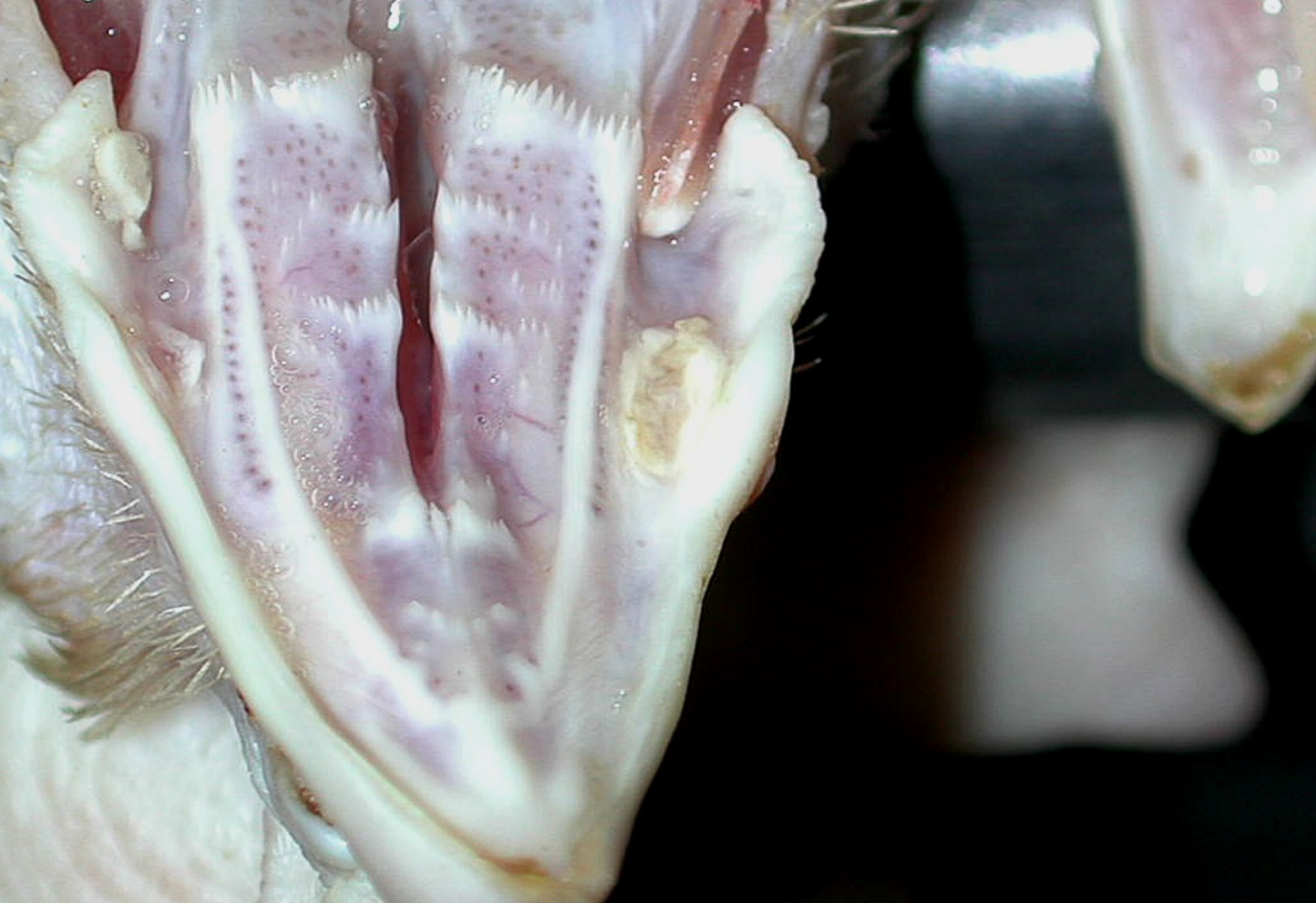
Ulcerative stomatitis – mycotoxins – T2