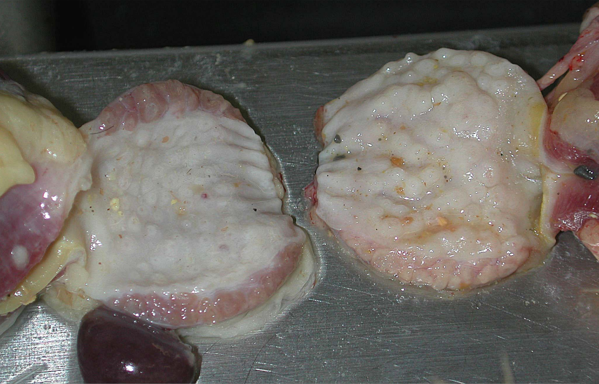
Proventriculi – normal (left) – hyperplasia (right) unknown