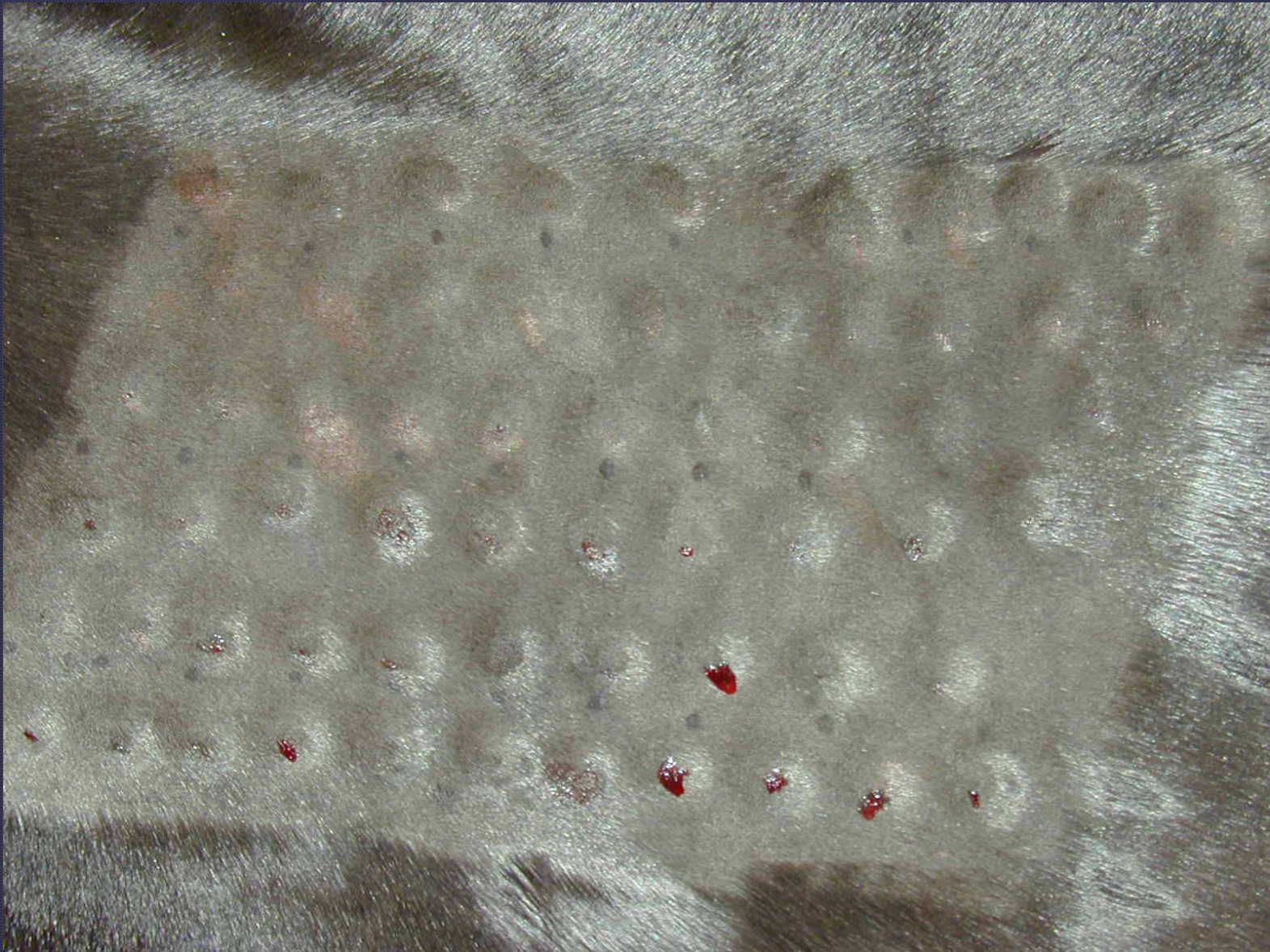
Intradermal skin test