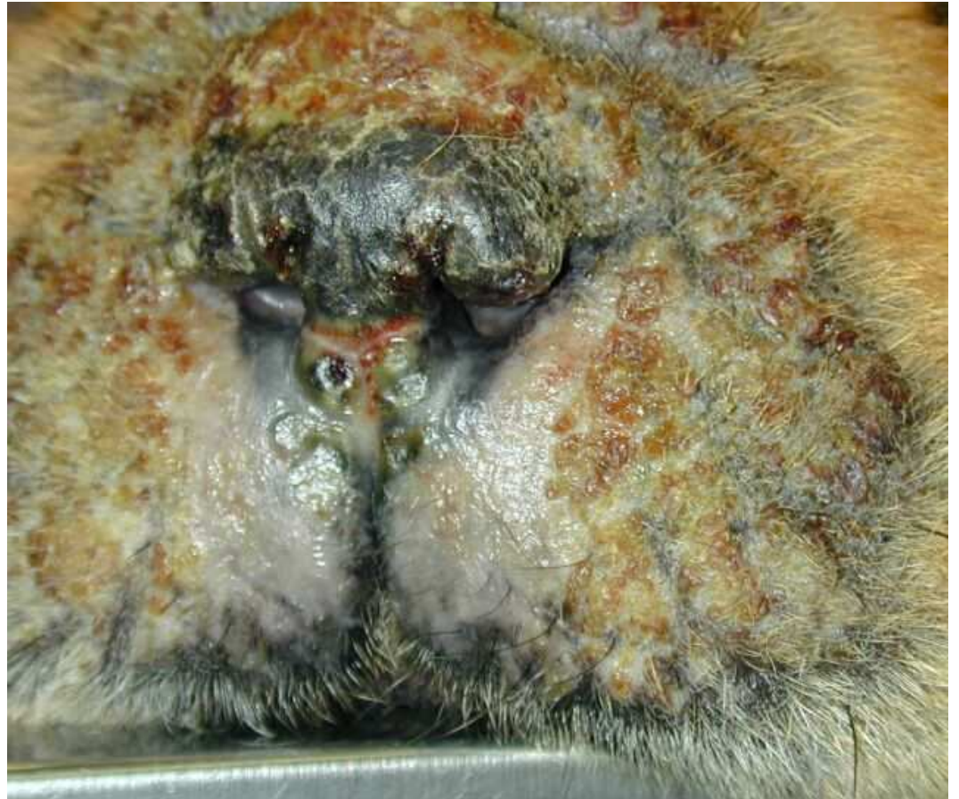
Suppurative crusts on the muzzle and nasal planum of a chow with pemphigus foliaceus