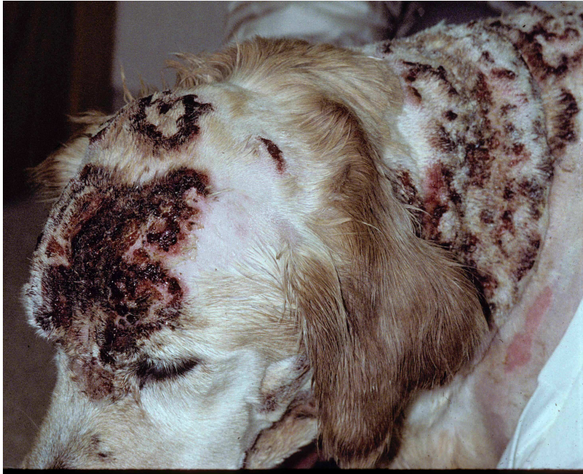
Hemorrhagic crusts in a Golden retriever with cutaneous vasculitis