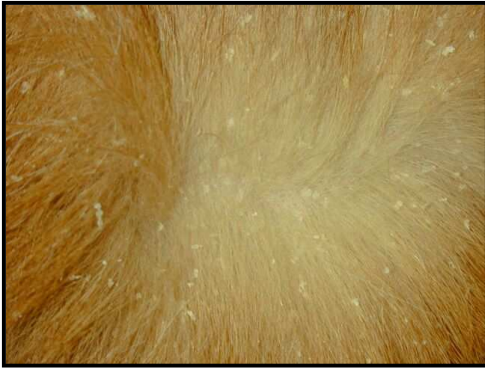
Scale (seborrhea sicca) due to Cheyletiella infestation in a dog

Heavy, adherent scale (known as a “seborrheic plaque”) →