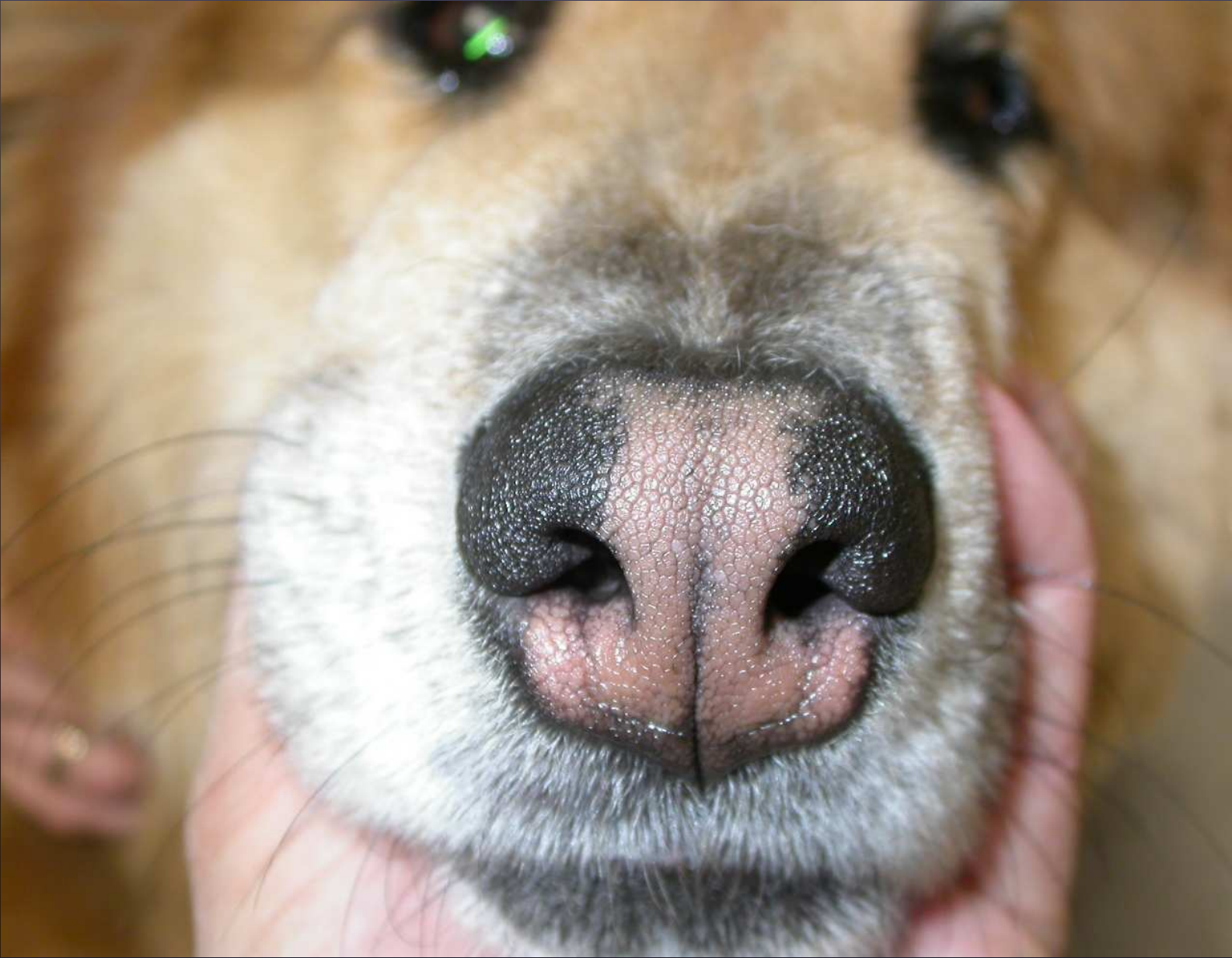
▶ "Snow nose or Dudley nose"