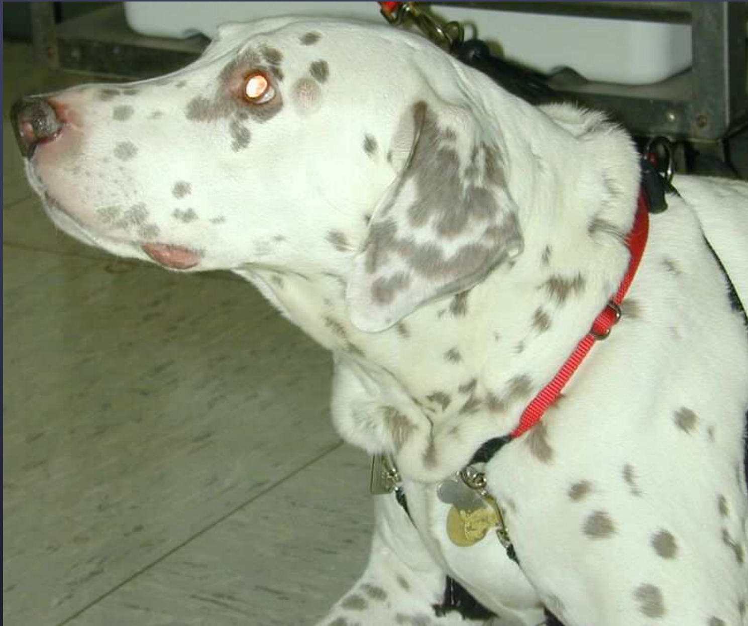
▶ Black hair follicular dysplasia