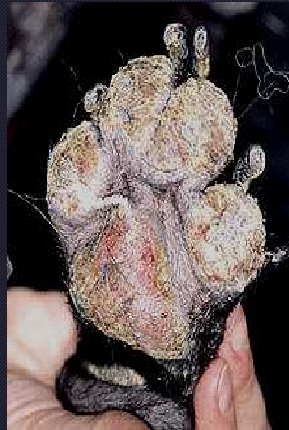
Footpad hyperkeratosis and crusting due to pemphigus foliaceus