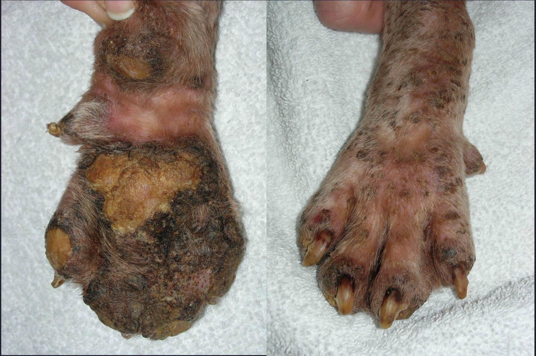
Lethal acrodermatitis- severe pododermatitis