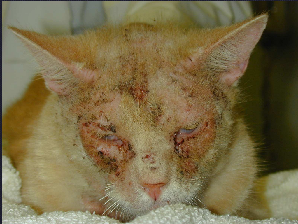
Severe facial pruritus in a food allergic cat