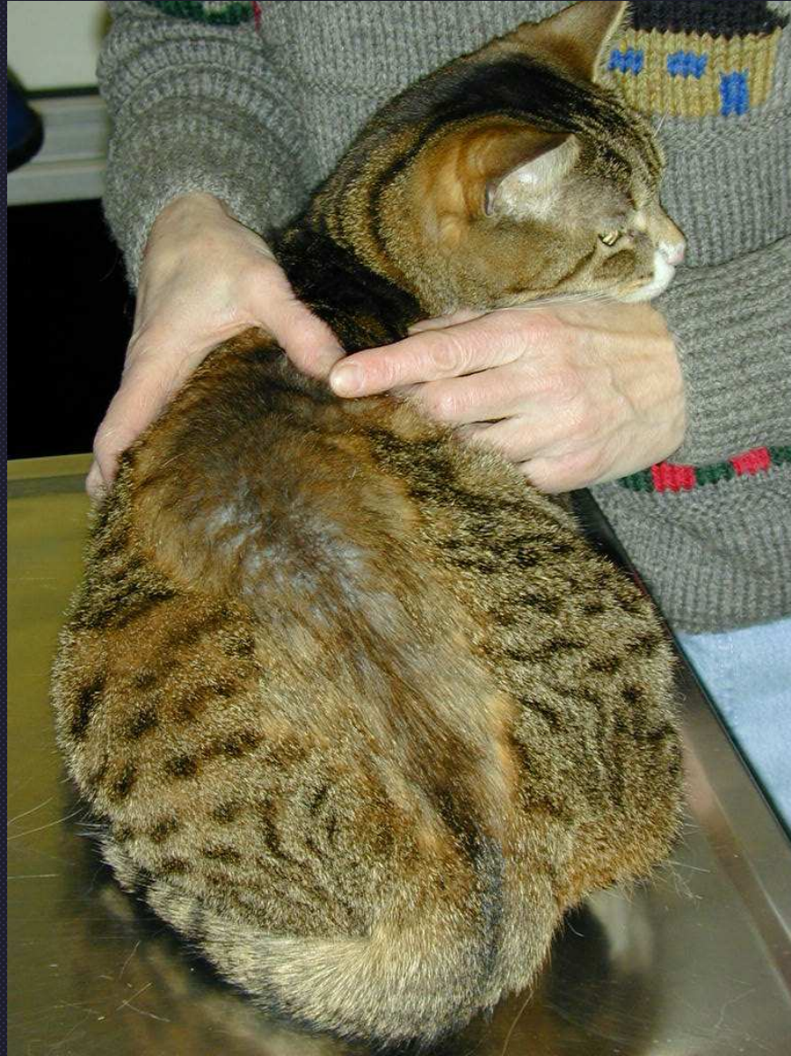
Flea allergy dermatitis