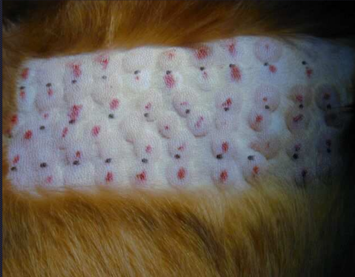
Intradermal skin test for allergen specific immunotherapy