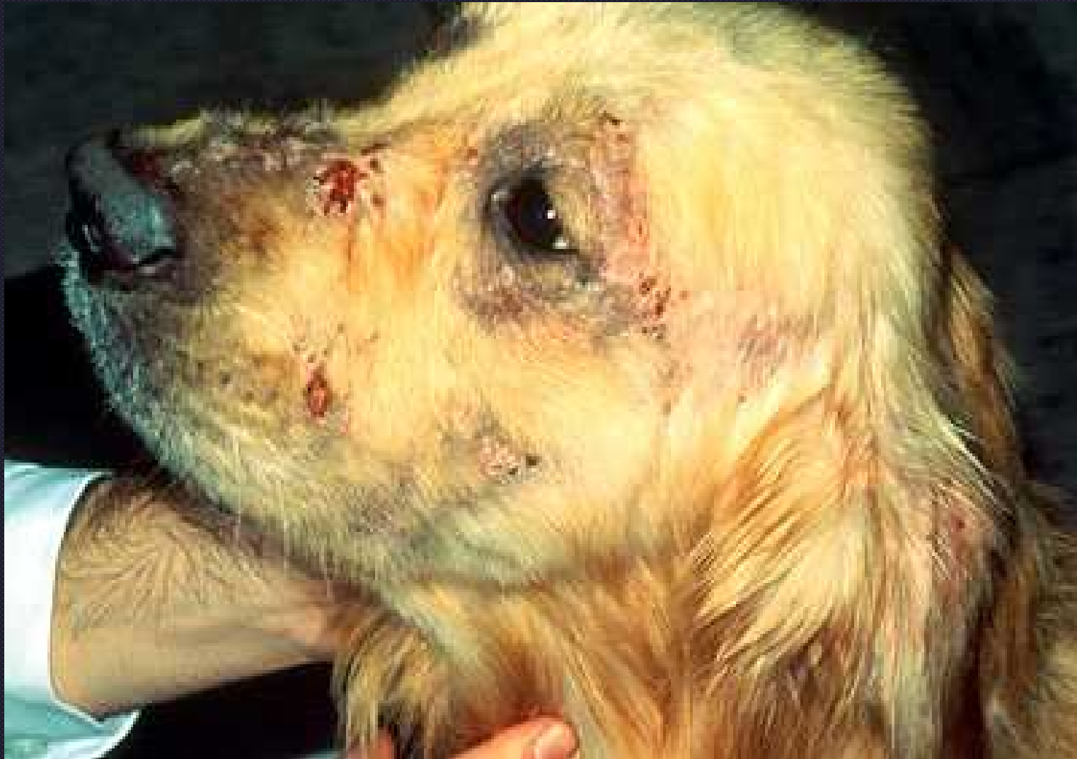
Sarcoptic mange— It is a hypersensitivity rxn to the mites!